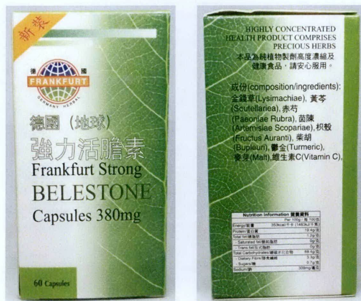
Figure 3. Unregistered FRANKFURT STRONG Belestone Capsules 380 mg

The FDA verified through post-marketing surveillance that the abovementioned food supplements are not authorized and the Certificates of Product Registration (CPR) have not been issued. Pursuant to the Republic Act No. 9711, otherwise known as the “Food and Drug Administration Act of 2009”, the manufacture, importation, exportation, sale,