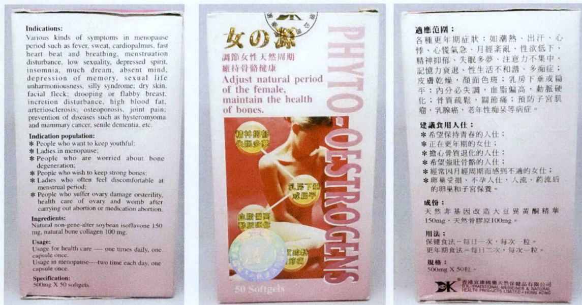
Figure 1. Unregistered Phyto-Oestrogens

The Food and Drug Administration (FDA) warns the public from purchasing and consuming the following unregistered food supplements: