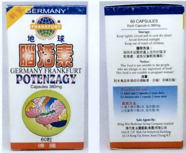
Figure 2. Unregistered GERMANY FRANKFURT Potenzagy Capsules 380 mg