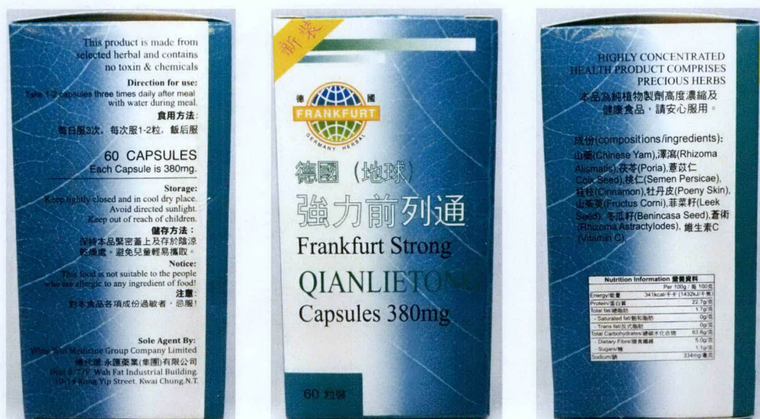
Figure 1. Unregistered PFRANKFURT STRONG Qianlietong Capsules 380 mg

The Food and Drug Administration (FDA) warns the public from purchasing and consuming the following unregistered food supplements: