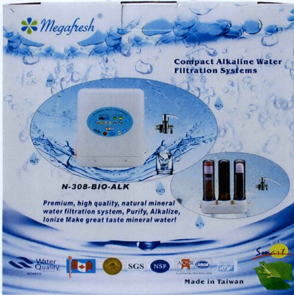
Figure 1. Unregistered Megafresh® Compact Alkaline Water Filtration Systems

The Food and Drug Administration (FDA) warns the general public against the purchase and use of the unregistered health related device: