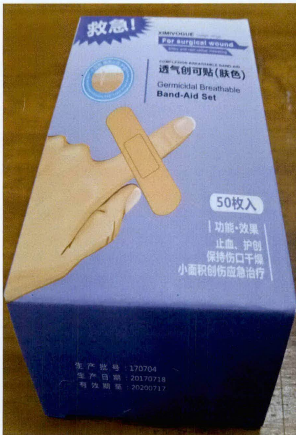
Figure 1. Unregistered Ximivogue Germicidal Breathable Band-Aid Set

The Food and Drug Administration (FDA) warns the general public and all healthcare professionals against the purchase and use of the unregistered medical devices: