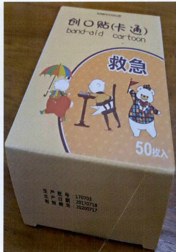
Figure 2. Unregistered Ximivogue Band-aid Cartoon