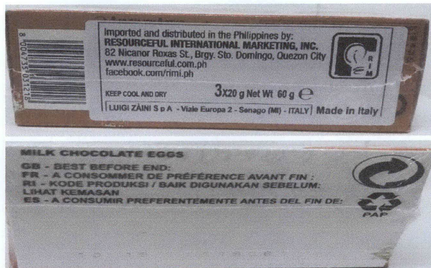
Figure 3. Unnotified Zaini 3 Milk Chocolate Eggs with a 3D Collection (Disney Pixar Cars)

The FDA verified through post-marketing surveillance that the abovementioned TCCA products are not authorized and the Certificates of Product Notification (CPN) have not been issued. Pursuant to the Republic Act No. 9711, otherwise known as the “Food and Drug Administration Act of 2009”, the manufacture, importation, exportation, sale, offering for sale, distribution, transfer, non-consumer use, promotion, advertising or sponsorship of health products without the proper authorization is prohibited.