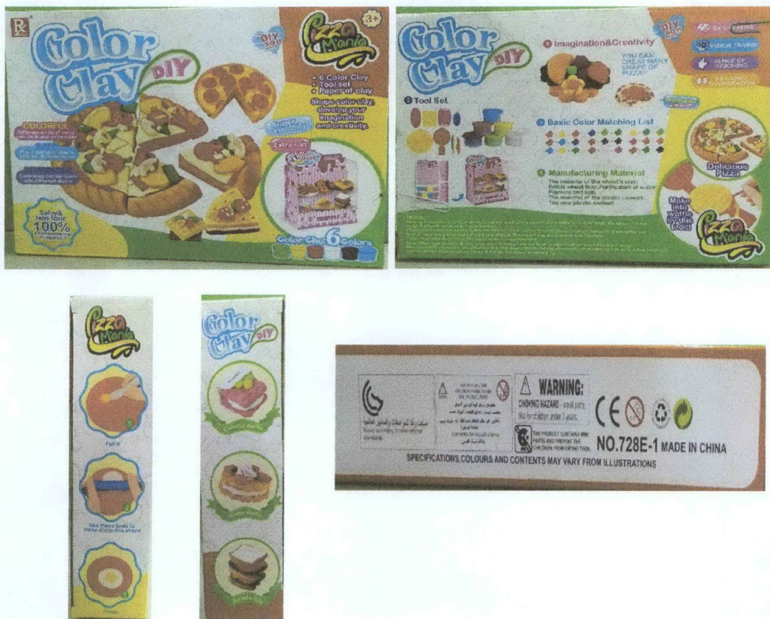
Figure 1. Unnotified Color Clay DIY Pizza Mania

The Food and Drug Administration (FDA) warns the public from purchasing and using the following Unnotified TCCAs: