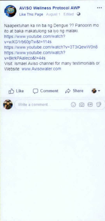
Figure 2. False, Deceptive, and Misleading Claims for the Food Products Ionic Coloidal Silver and Aviso Water

DENGUE ba ang problema mo ?? Subukan mo ito at ibibigay ko ng FREE sa 20 taong naapektuhan ng DENGUE. Ang gagawin mo lang ay kausapin mo lang ang Hospital na siya ang maki pag usap sa amin. May 18 years ko ng ginagamit itong Aviso water at 10 yrs ang Ionics water sa mga taong naapektuhan ng Dengue. Huag tatawag ng hindi napanood ang video link na ibibigay namin.