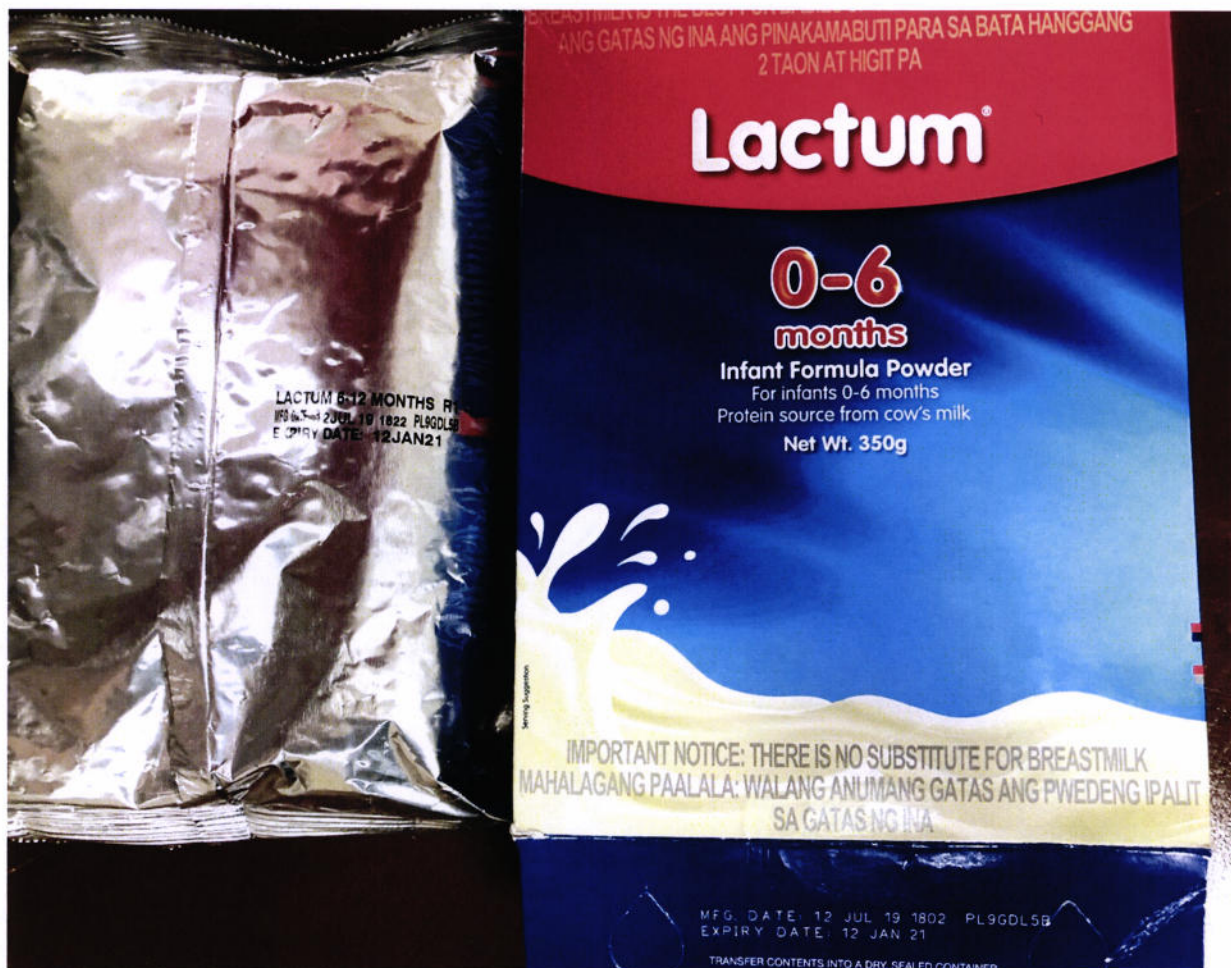
Figure 1. Incorrect Secondary Packaging of (Foil Bag) with Markings of LACTUM Instant Formula Powder 6-12 Months (left) and Primary Packaging (Carton Box) LACTUM Instant Formula Powder 0-6 Mos. (right)

The public is hereby advised by the Food and Drug Administration (FDA) regarding the voluntary recall of Mead Johnson Nutrition of LACTUM Instant Formula Powder 0-6 Months, with batch no. PL9GDL5B, manufacturing date 12 July 2019 and expiration date 12 January 2021 due to difference in the actual product inside the box which instead contains LACTUM Infant Formula Powder 6-12 Months.