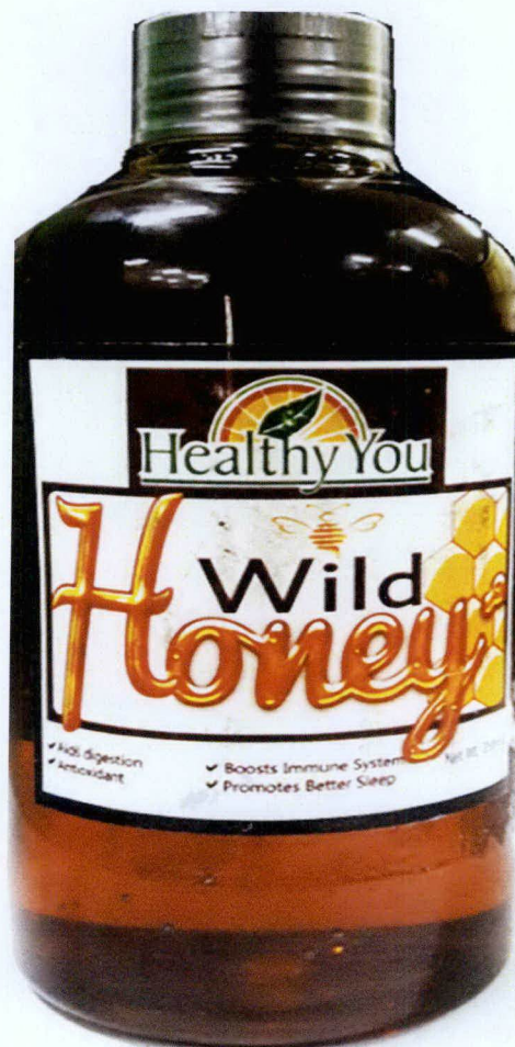
Figure 1. Unregistered HEALTHY YOU WILD HONEY

The Food and Drug Administration (FDA) warns the public from purchasing and consumption of the following unregistered food products and food supplement: