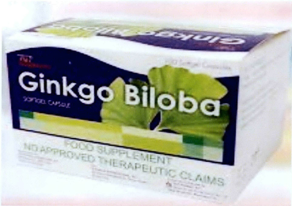
Figure 2. Unregistered TGP GINKGO BILOBA SOFTGEL CAPSULE

The FDA verified through post-marketing surveillance that the abovementioned food and supplement products are not registered and the Certificates of Product Registration (CPR) have not yet been issued. Pursuant to the Republic Act No. 9711, otherwise known as the “Food and Drug Administration Act of 2009”, the manufacture, importation, exportation, sale, offering for sale, distribution, transfer, non-consumer use, promotion, advertising or sponsorship of health products without the proper authorization is prohibited.