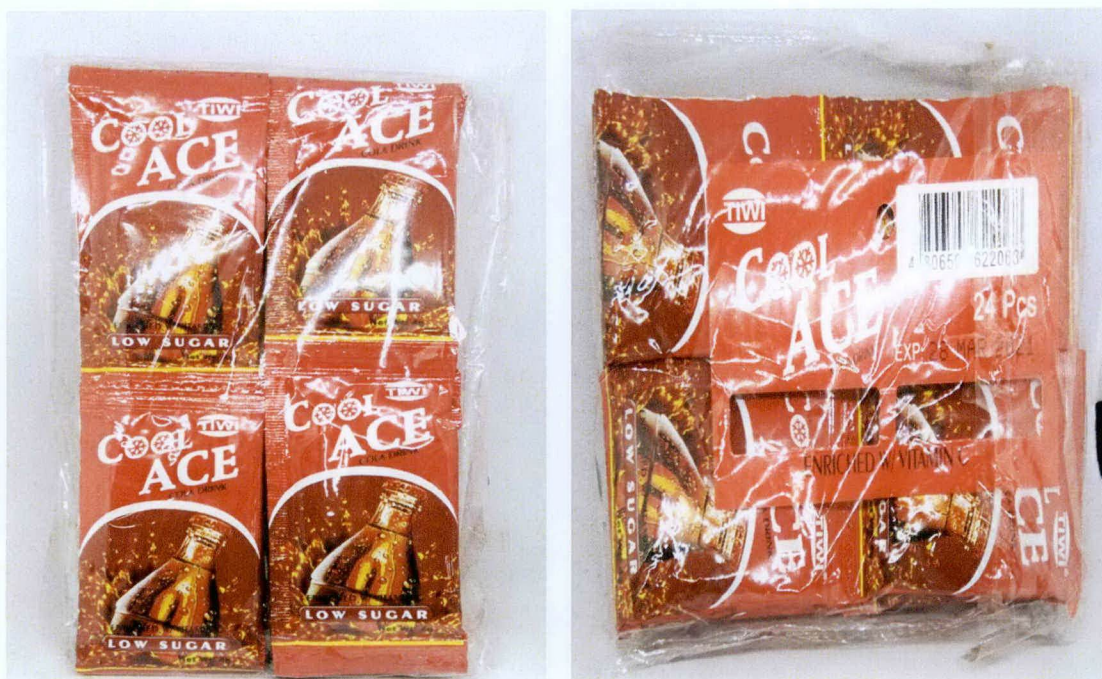
Figure 1. Unregistered TIWI® Cool Ace Cola Drink (24pcs)

The Food and Drug Administration (FDA) advises the public from purchasing and consumption of the following unregistered food products: