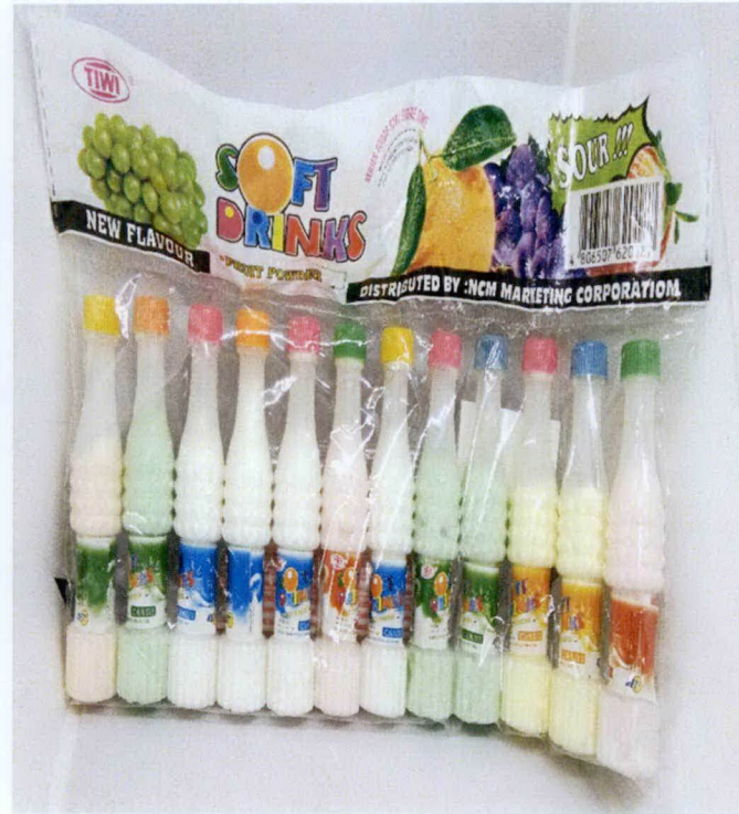
Figure 3. Unregistered TIWI Soft Drinks Fruit Powder Candy (12pcs x 8grams each)