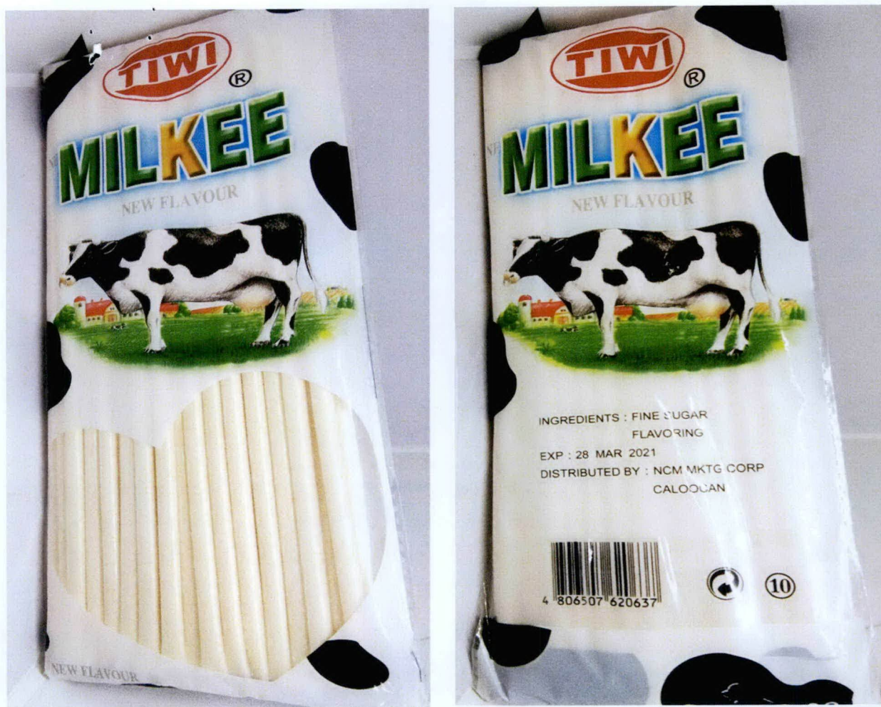
Figure 4. Unregistered TIWI MILKEE Sticks Candy

The FDA verified through post-marketing surveillance that the abovementioned food products are not authorized and the Certificates of Product Registration (CPR) have not been issued. Pursuant to the Republic Act No. 9711, otherwise known as the “Food and Drug Administration Act of 2009”, the manufacture, importation, exportation, sale, offering for sale, distribution, transfer, non-consumer use, promotion, advertising or sponsorship of health products without the proper authorization is prohibited.