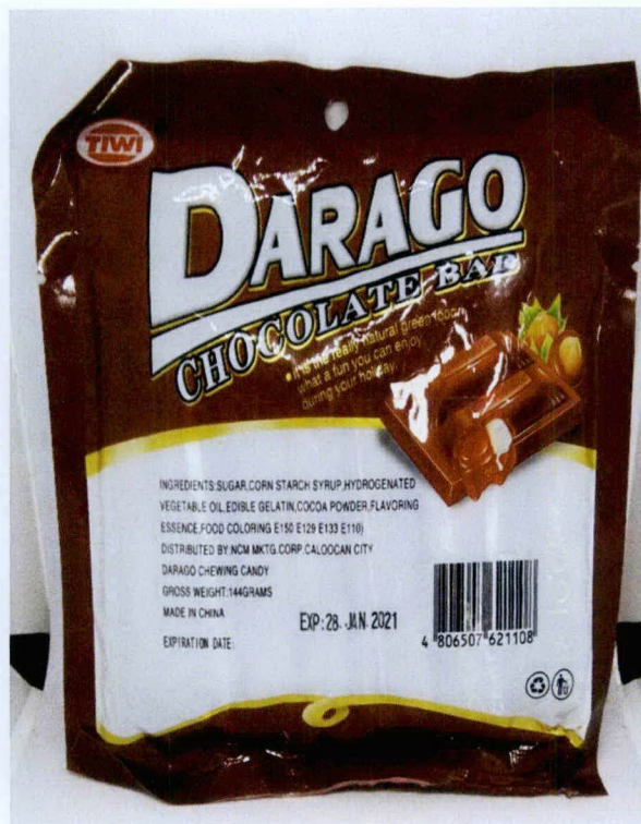
Figure 2. Unregistered TIWI DARAGO Chocolate Bar 24pcs (144grams)