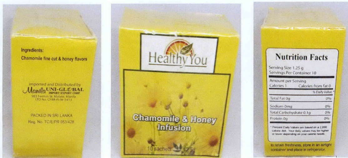
Figure 5. Unregistered HEALTHY YOU Chamomile & Honey Infusion