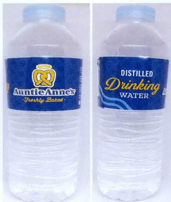
Figure 3. Unregistered AUNTIE ANNE'S Freshly Baked Distilled Drinking Water