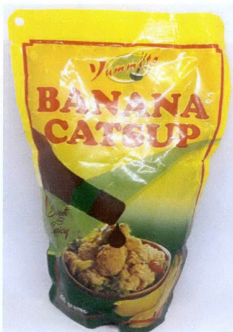
Figure 1. Unregistered YUMMITO BANANA CATSUP Sweet and Spicy

The Food and Drug Administration (FDA) warns the public from purchasing and consumption of the following unregistered food products: