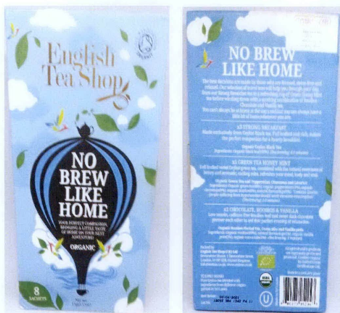
Figure 2. Unregistered ENGLISH TEA SHOP No Brew Like Home