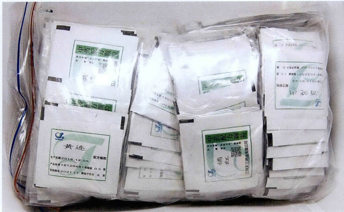
Figure 2. Unregistered ASSORTED TEA BAGS (In Chinese Character).