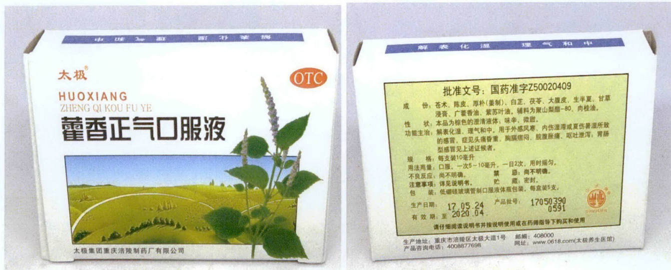
Figure 1. Unregistered HUOXIANG ZHENG QI KOU FE YU with barcode no: 6918163020886 (In Chinese Character).

The Food and Drug Administration (FDA) advises the public from purchasing and consumption of the following unregistered food products: