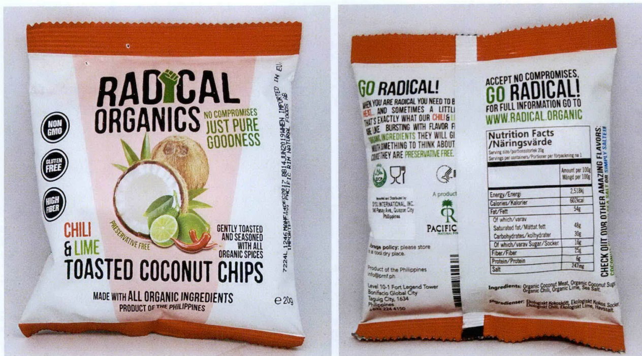
Figure 3. Unregistered RADICAL ORGANICS Toasted Coconut Chips Chili & Lime (20grams).

The FDA verified through post-marketing surveillance that the abovementioned food products are not authorized and the Certificates of Product Registration (CPR) have not been issued. Pursuant to the Republic Act No. 9711, otherwise known as the “Food and Drug Administration Act of 2009”, the manufacture, importation, exportation, sale, offering for sale, distribution, transfer, non-consumer use, promotion, advertising or sponsorship of health products without the proper authorization is prohibited.