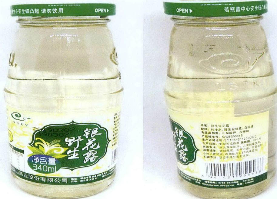
Figure 1. Unregistered Glass bottle 340mL with barcode: 69941421955538 (In Chinese Character).

The Food and Drug Administration (FDA) advises the public from purchasing and consumption of the following unregistered food products: