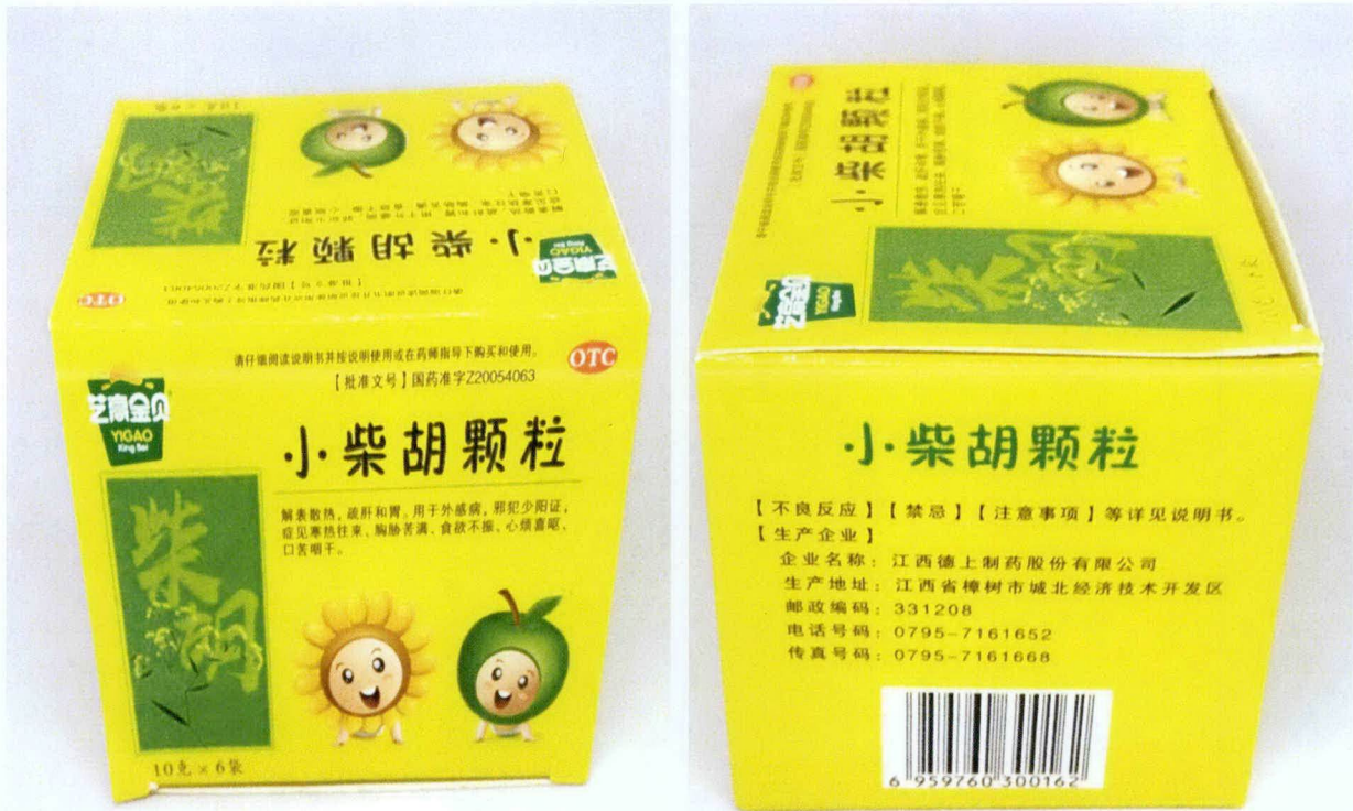
Figure 2. Unregistered Yellow Box with Apple and Sunflower drawings with Barcode: 6959760300162 (In Chinese Character).