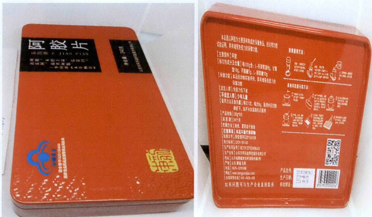
Figure 3. Unregistered E Jiao Pian with Barcode: 6957953290016 (In Chinese Character).