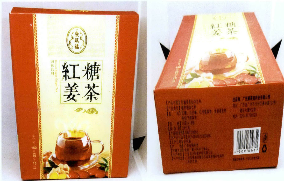
Figure 4. Unregistered Brown Sugar Ginger Tea) with barcode: 6926309805631(In Chinese Character.

The FDA verified through post-marketing surveillance that the abovementioned food products are not authorized and the Certificates of Product Registration (CPR) have not been issued. Pursuant to the Republic Act No. 9711, otherwise known as the “Food and Drug Administration Act of 2009”, the manufacture, importation, exportation, sale, offering for sale, distribution, transfer, non-consumer use, promotion, advertising or sponsorship of health products without the proper authorization is prohibited.