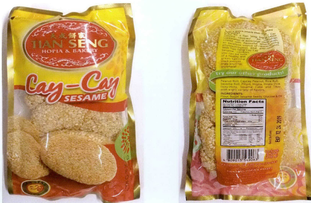
Figure 2. Unregistered TIAN SENG HOPIA & BAKERY Cay-Cay Sesame