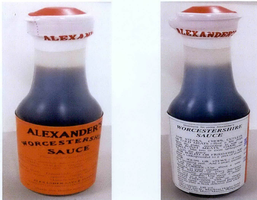
Figure 4. Unregistered ALEXANDER'S Worcestershire Sauce

The FDA verified through post-marketing surveillance that the abovementioned food products are not authorized and the Certificates of Product Registration (CPR) have not been issued. Pursuant to the Republic Act No. 9711, otherwise known as the "Food and Drug Administration Act of 2009", the manufacture, importation, exportation, sale, offering for sale, distribution, transfer, non-consumer use, promotion, advertising or sponsorship of health products without the proper authorization is prohibited.