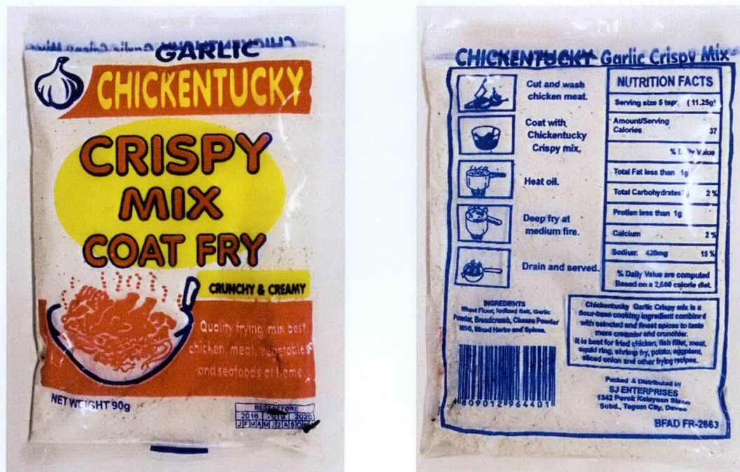
Figure 3. Unregistered CHICKENTUCKY Crispy Mix Coat Fry, Garlic Flavor