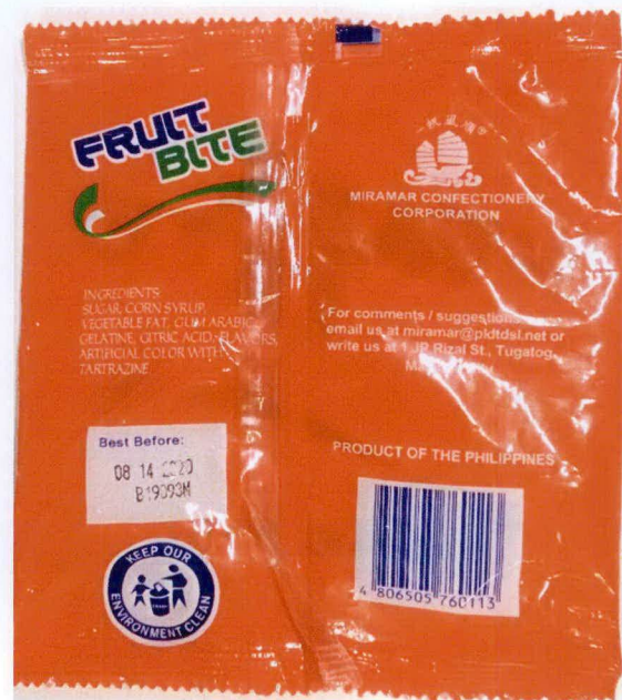
Figure 1. Unregistered FRUIT BITE Fruits Candy