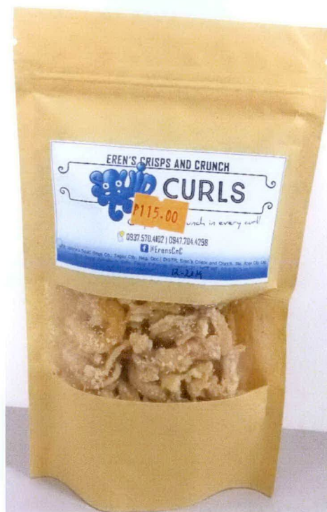
Figure 2. Unregistered EREN'S CRISPS AND CRUNCH Squid Curls

The FDA verified through post-marketing surveillance that the abovementioned food products are not authorized and the Certificates of Product Registration (CPR) have not been issued. Pursuant to the Republic Act No. 9711, otherwise known as the "Food and Drug Administration Act of 2009", the manufacture, importation, exportation, sale, offering for sale, distribution, transfer, non-consumer use, promotion, advertising or sponsorship of health products without the proper authorization is prohibited.