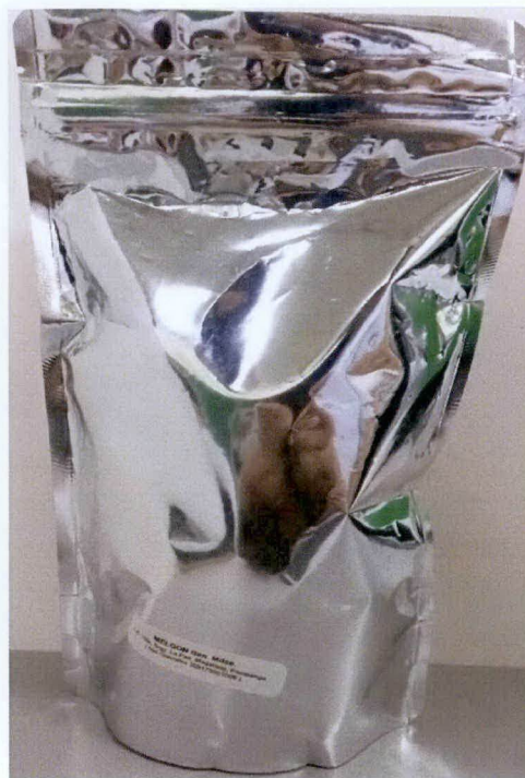
Figure 1. Unregistered MELGON Crispy Mushroom Original