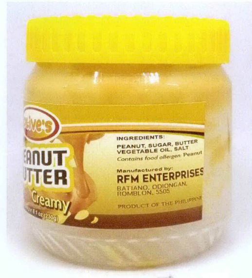
Figure 2. Unregistered OLIVE'S Peanut Butter Creamy