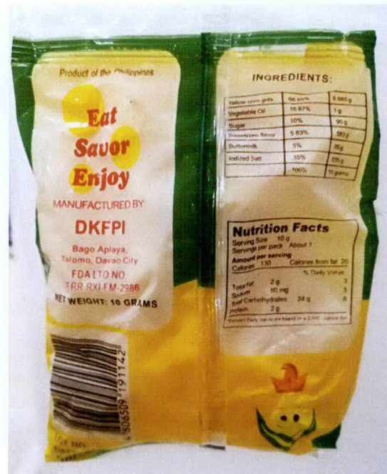
Figure 1. Unregistered ALIBABA Sweetcorn Flavor