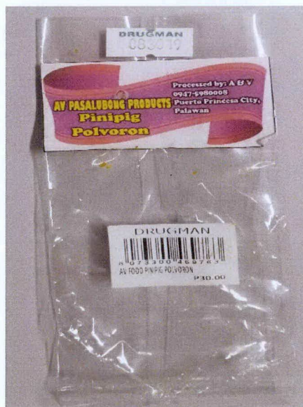
Figure 4. Unregistered AV PASALUBONG PRODUCTS Pinipig

The FDA verified through post-marketing surveillance that the abovementioned food products are not authorized and the Certificates of Product Registration (CPR) have not been issued. Pursuant to the Republic Act No. 9711, otherwise known as the “Food and Drug Administration Act of 2009”, the manufacture, importation, exportation, sale, offering for sale, distribution, transfer, non-consumer use, promotion, advertising or sponsorship of health products without the proper authorization is prohibited.