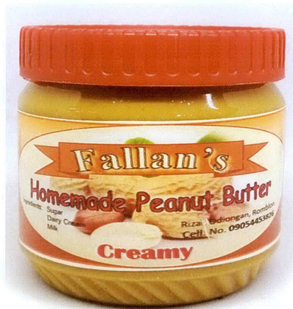
Figure 3. Unregistered FALLAN'S Homemade Peanut Butter