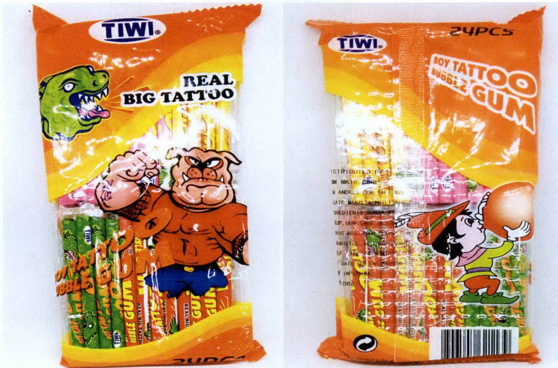
Figure 3. Unregistered TIWI® Real Big Tattoo Bubble Gum