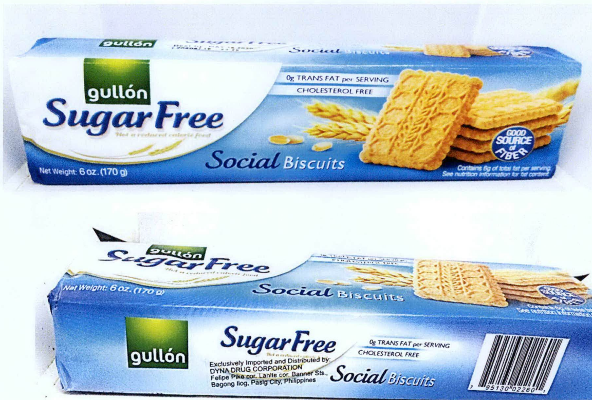
Figure 1. Unregistered GULLON Social Biscuits Sugar Free, 6 oz. (170g)

The Food and Drug Administration (FDA) advises the public from purchasing and consumption of the following unregistered food products: