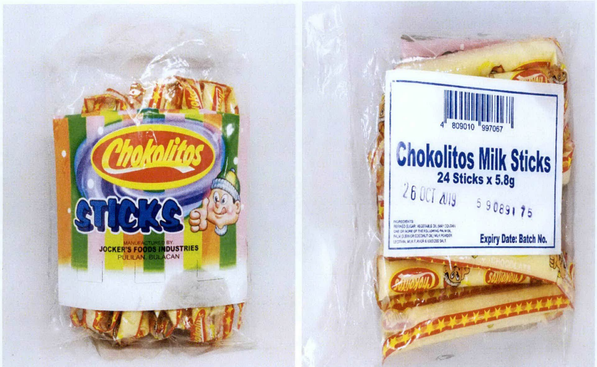
Figure 4. Unregistered CHOKOLITOS Milk Sticks (24 sticks x 5.8 g)