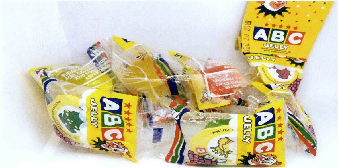
Figure 2. Unregistered ABC Jelly (1Strip x 8 pcs)