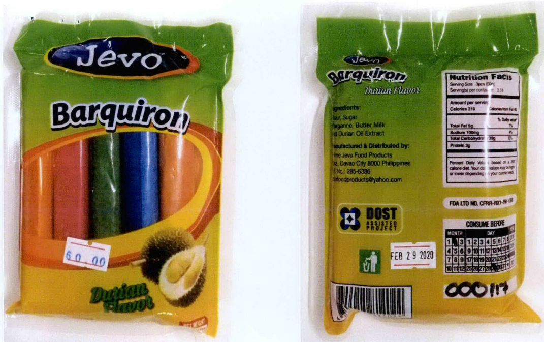
Figure 4. Unregistered JEVO Barquiron, Durian Flavor

The FDA verified through post-marketing surveillance that the abovementioned food products are not authorized and the Certificates of Product Registration (CPR) have not been issued. Pursuant to the Republic Act No. 9711, otherwise known as the “Food and Drug Administration Act of 2009”, the manufacture, importation, exportation, sale, offering for sale, distribution, transfer, non-consumer use, promotion, advertising or sponsorship of health products without the proper authorization is prohibited.