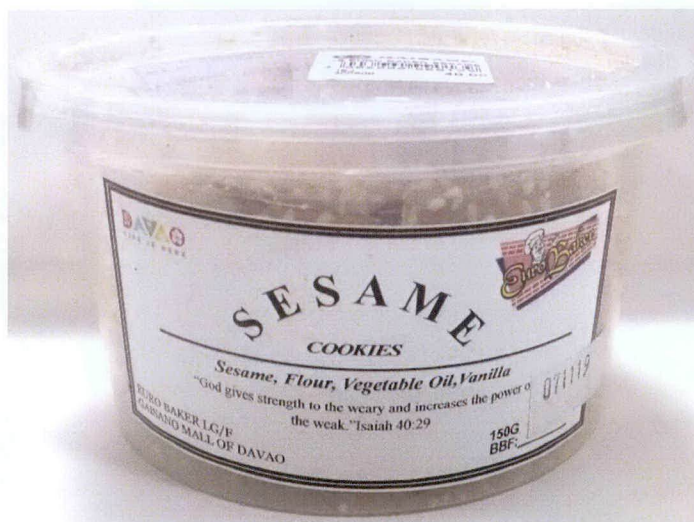
Figure 3. Unregistered EUROBAKER Sesame Cookies