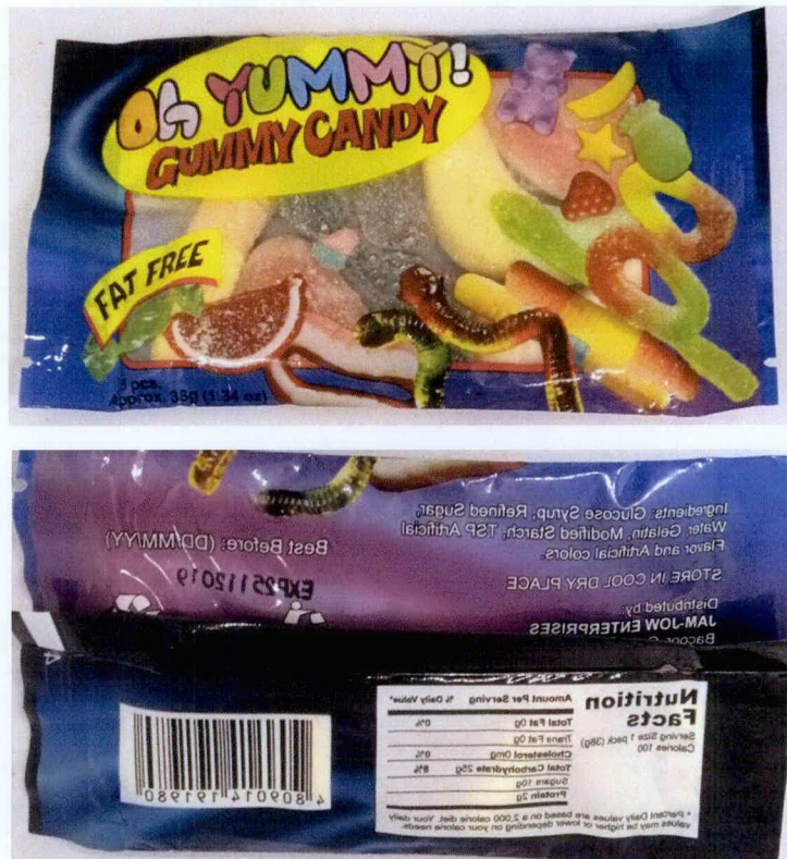
Figure 1. Unregistered OH YUMMY! Gummy Candy Fat Free

The Food and Drug Administration (FDA) advises the public from purchasing and consumption of the following unregistered food products: