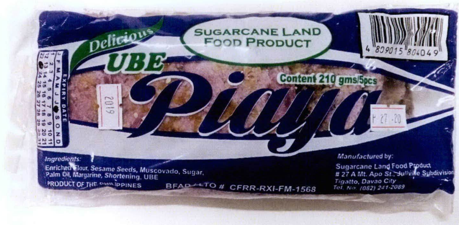
Figure 2. Unregistered SUGARCANE LAND FOOD PRODUCT Delicious Ube Piaya