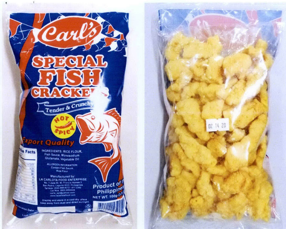
Figure 1. Unregistered CARL'S Special Fish Crackers(Tender & Crunchy) Hot & Spicy