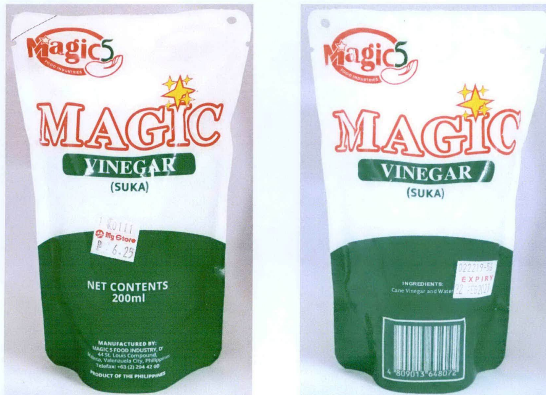
Figure 3. Unregistered MAGIC Vinegar