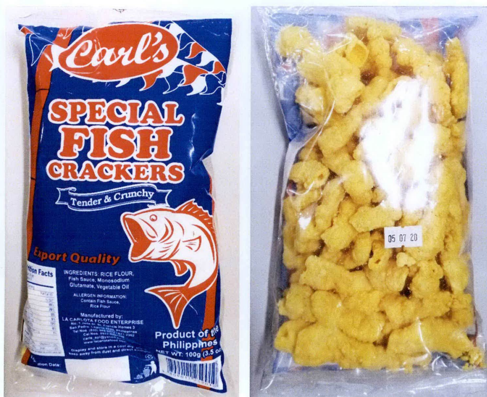
Figure 1. Unregistered CARL'S Special Fish Crackers (Tender & Crunchy)

The Food and Drug Administration (FDA) advises the public from purchasing and consumption of the following unregistered food products: