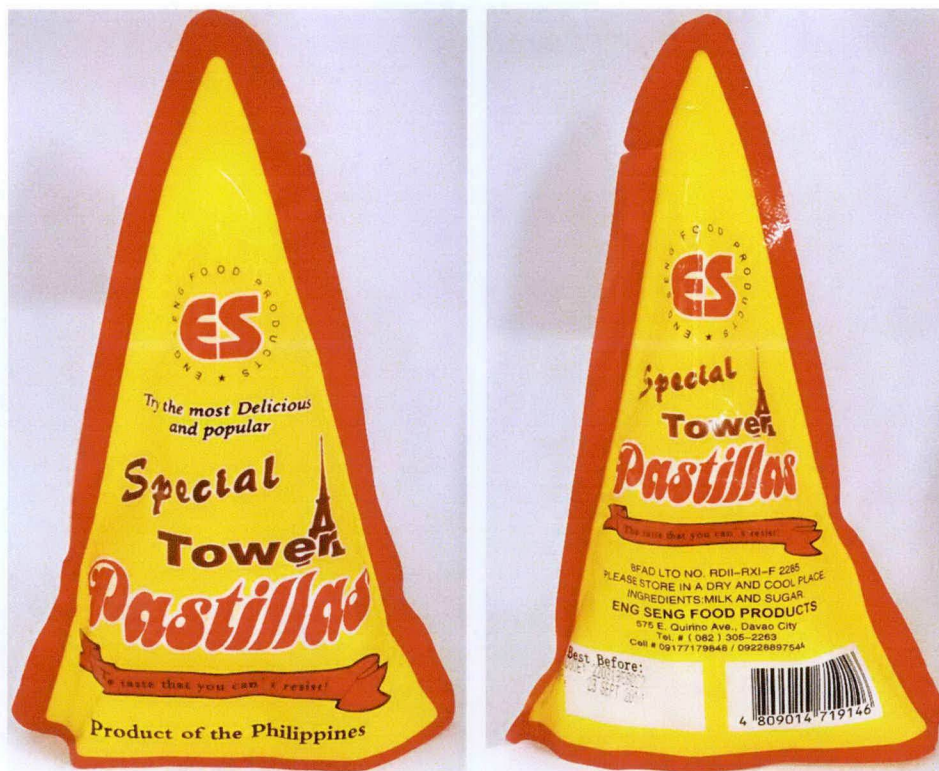
Figure 4. Unregistered ENG SENG FOOD PRODUCTS Special Tower Pastillas

The FDA verified through post-marketing surveillance that the abovementioned food products are not authorized and the Certificates of Product Registration (CPR) have not been issued. Pursuant to the Republic Act No. 9711, otherwise known as the “Food and Drug Administration Act of 2009”, the manufacture, importation, exportation, sale, offering for sale, distribution, transfer, non-consumer use, promotion, advertising or sponsorship of health products without the proper authorization is prohibited.