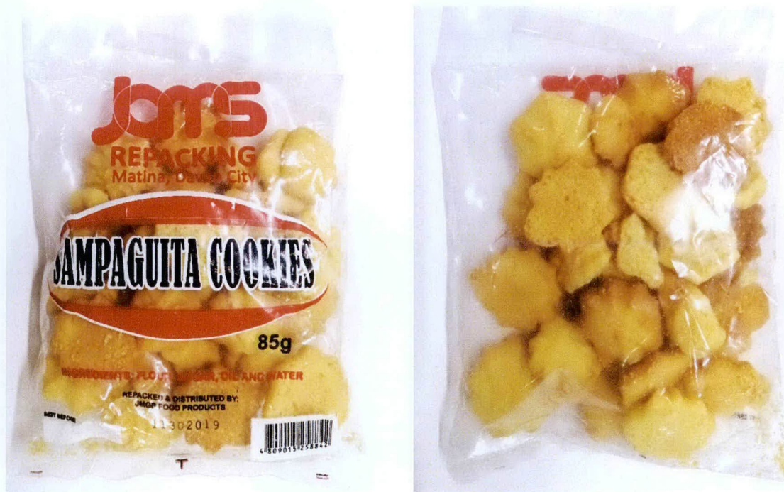
Figure 4. Unregistered JAMS Sampaguita Cookies

The FDA verified through post-marketing surveillance that the abovementioned food products are not authorized and the Certificates of Product Registration (CPR) have not been issued. Pursuant to the Republic Act No. 9711, otherwise known as the “Food and Drug Administration Act of 2009”, the manufacture, importation, exportation, sale, offering for sale, distribution, transfer, non-consumer use, promotion, advertising or sponsorship of health products without the proper authorization is prohibited.