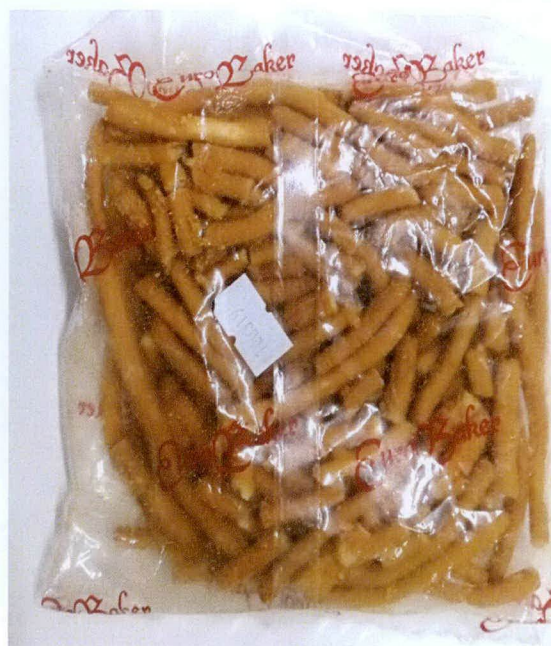
Figure 1. Unregistered DAVAO Bread Sticks, Crisp!Crackle!