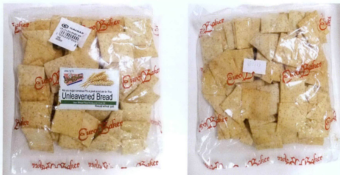
Figure 3. Unregistered EUROBAKER Unleavened Bread