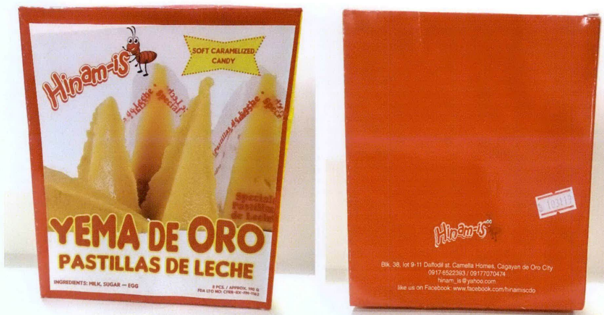
Figure 2. Unregistered HINAM-IS Yema De Oro, Pastillas de Leche