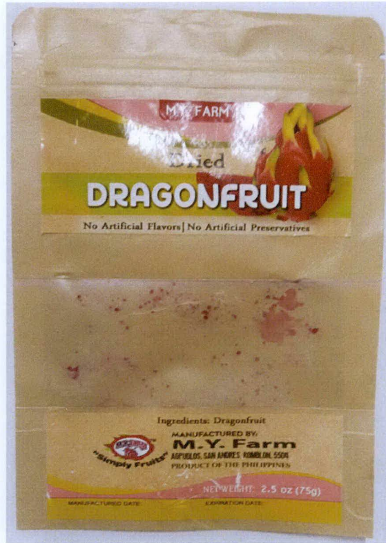
Figure 3. Unregistered M.Y. FARM DRIED DRAGON FRUIT