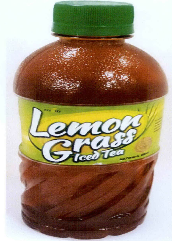
Figure 2. Unregistered LEMON GRASS ICED TEA