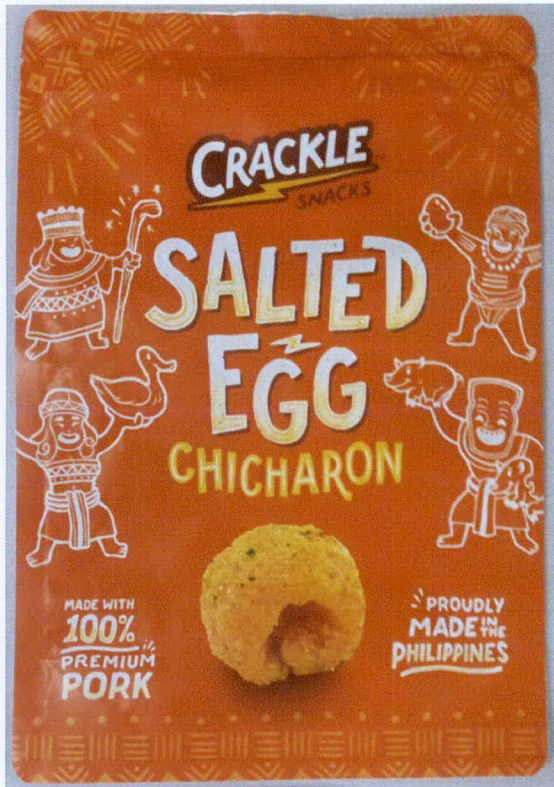
Figure 2. Unregistered CRACKLE SNACKS SALTED EGG CHICHARON