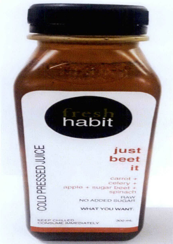
Figure 1. DIZON'S FARMS FRESH HABIT Cold Pressed Juice – Just Beet It