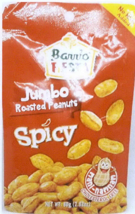
Figure 4. Unregistered BARRIO FIESTA Jumbo Roasted Peanuts Spicy