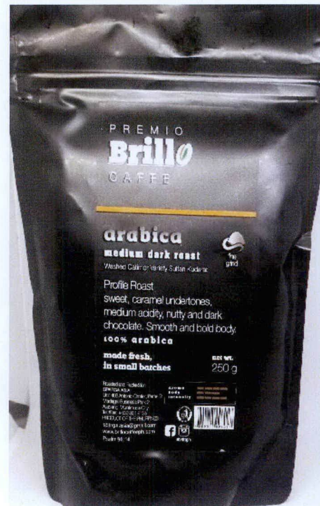
Figure 5. Unregistered PREMIO BRILLO Caffe Arabica Medium Dark Roast