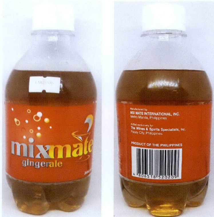
Figure 1. Unregistered MIXMATE Gingerale

The Food and Drug Administration (FDA) warns the public from purchasing and consumption of the following unregistered food products: