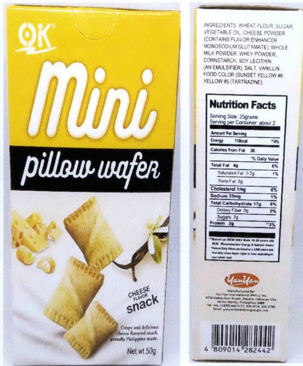
6. Figure 2. Unregistered OK ® MINI Pillow Wafer