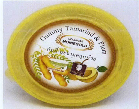
Figure 3. MONIEGOLD Gummy Tamarind & Plum