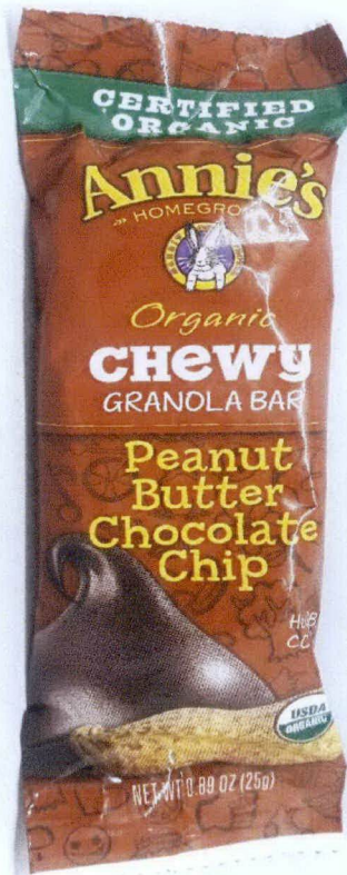
Figure 3. Unregistered ANNIE'S Homegrow Organic Chewy Granola Bar Peanut Butter Chocolate Chip