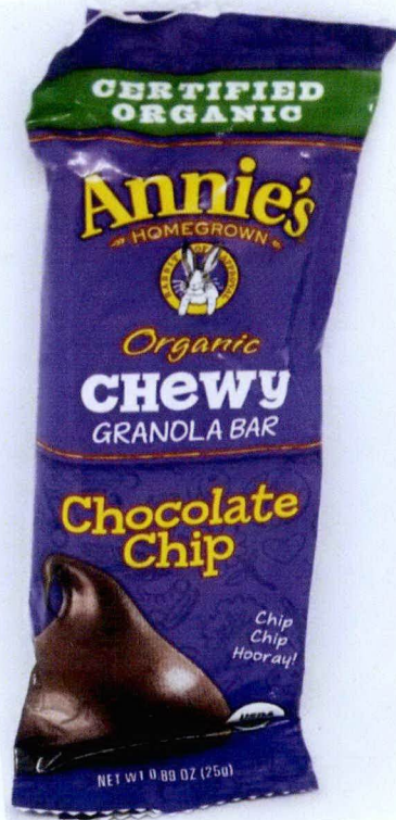
Figure 2. Unregistered ANNIE'S Homegrown Organic Chewy Granola Bar Chocolate Chip