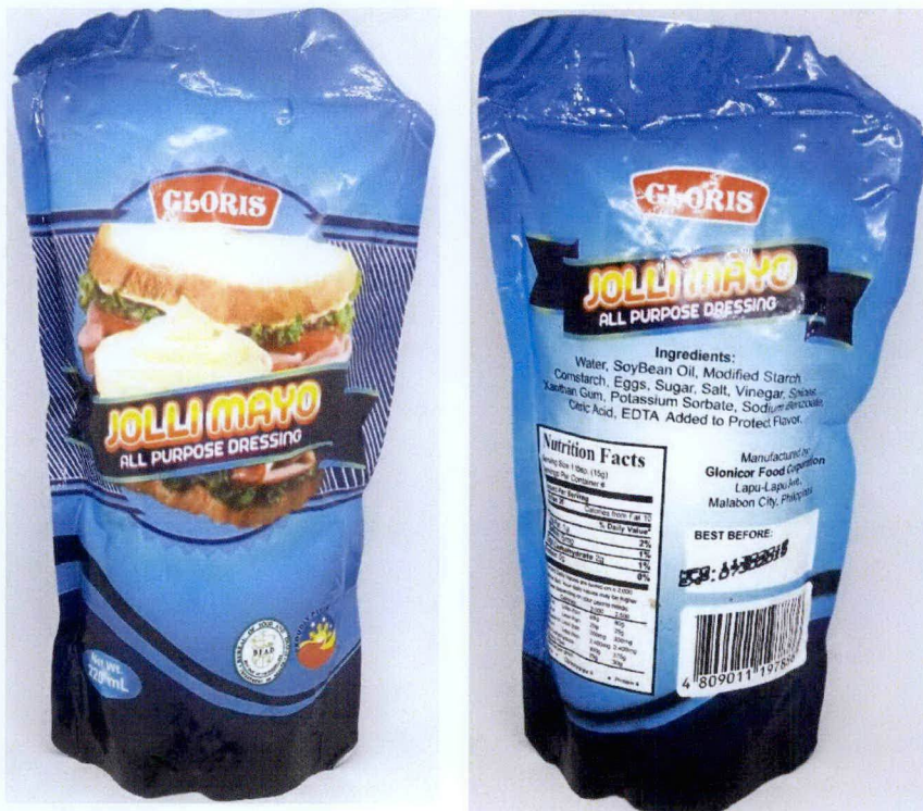
Figure 1. Unregistered GLORIS JOLLI Mayo All Purpose Dressing

The Food and Drug Administration (FDA) warns the public from purchasing and consumption of the following unregistered food products: