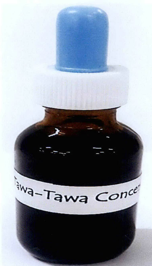
Figure 4. Unregistered S. TAWA-TAWA CONCENTRATE