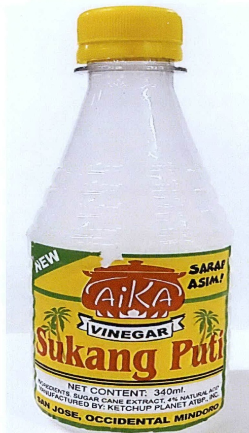
Figure 1. Unregistered AIKA VINEGAR SUKANG PUTI

The Food and Drug Administration (FDA) warns the public from purchasing and consumption of the following unregistered food and supplement products: