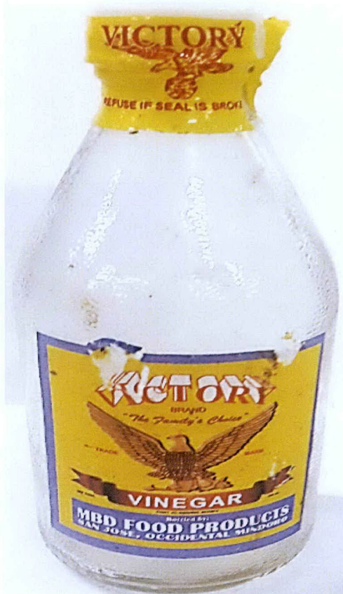
Figure 2. Unregistered VICTORY BRAND THE FAMILY'S CHOICE VINEGAR