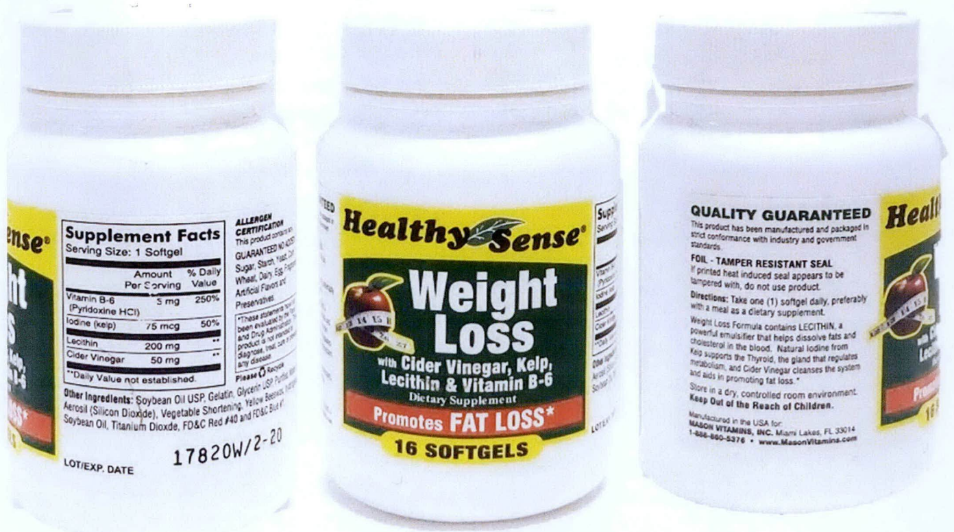
Figure 2. Unregistered Healthy Sense Weight Loss with Cider Vinegar, Kelp, Lecithin & Vitamin B-6 Dietary Supplement