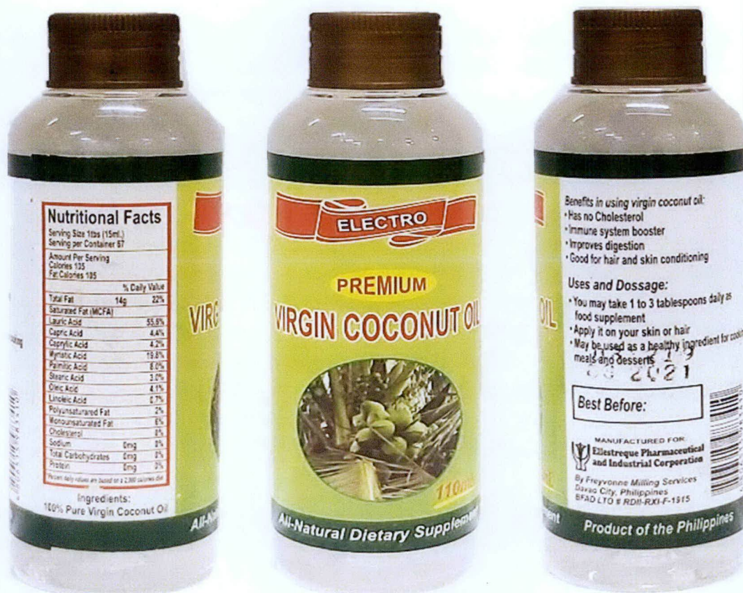
Figure 4. Unregistered ELECTRO Premium Virgin Coconut Oil, All Natural Dietary Supplement

The FDA verified through post-marketing surveillance that the abovementioned food supplements are not authorized and the Certificates of Product Registration (CPR) have not been issued. Pursuant to the Republic Act No. 9711, otherwise known as the “Food and Drug Administration Act of 2009”, the manufacture, importation, exportation, sale, offering for sale, distribution, transfer, non-consumer use, promotion, advertising or sponsorship of health products without the proper authorization is prohibited.