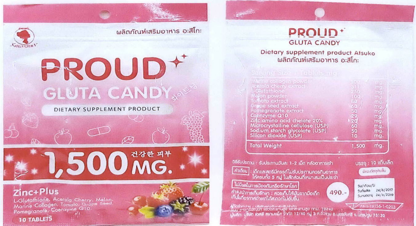
Figure 3. Unregistered KHUNCHAN Proud Gluta Candy Dietary Supplement Product