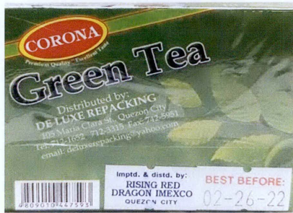
Figure 2. Unregistered CORONA Premium Quality Excellent Taste Green Tea