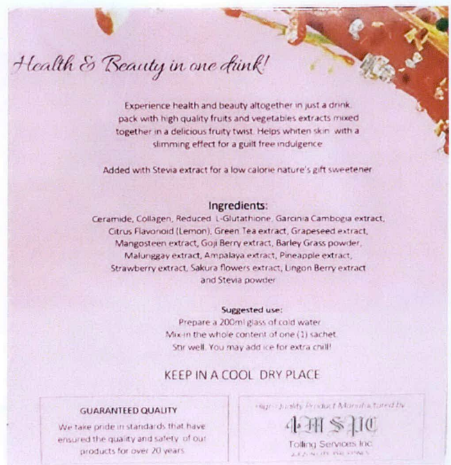
Figure 3. Unregistered PMS Lipoglow Whitening and Slimming Juice Sugar Free