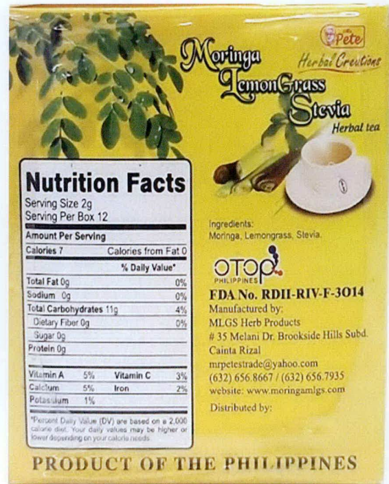
Figure 1. Unregistered MR. PETE HERBAL CREATIONS Moringa (Malunggay) Lemon Grass Stevia Herbal Tea