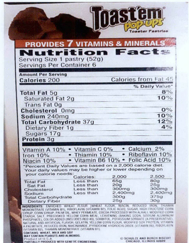
Figure 3. Unregistered TOAST' EM POP – UPS Toaster Pastries Frosted Chocolate Fudge