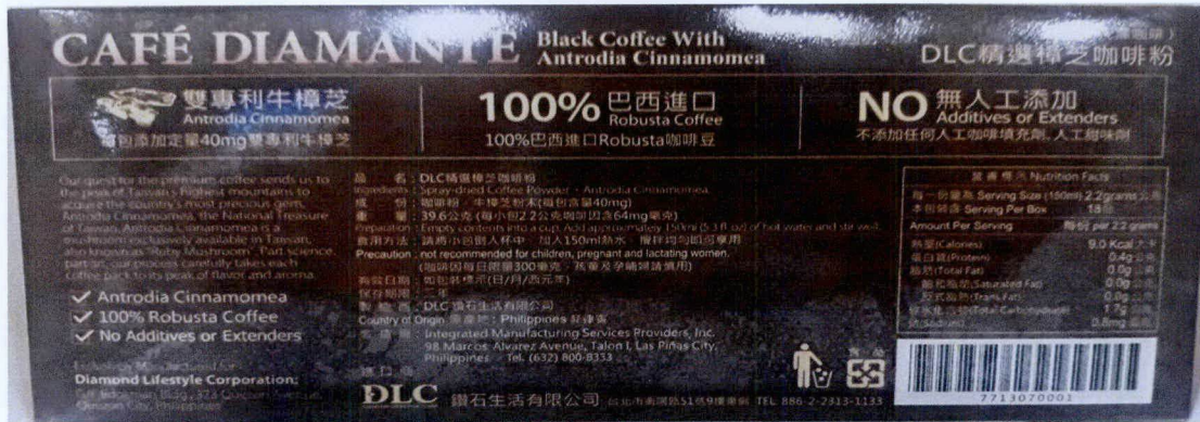
Figure 4. Unregistered DLC Black Coffee Café Diamante Real Gourmet Coffee Antrodia cinnamomea 100% Robusta Coffee