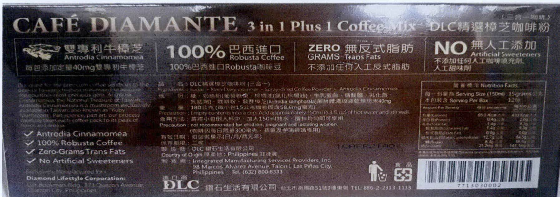
Figure 5. Unregistered DLC 3 in 1 Plus 1 Coffee Mix Antrodia cinnamomea 100% Robusta Coffee Zero Trans Fat No Artificial Sweeteners