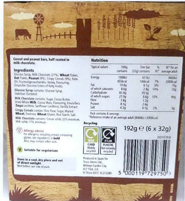
Figure 1. Unregistered TESCO Peanut Munch Bars