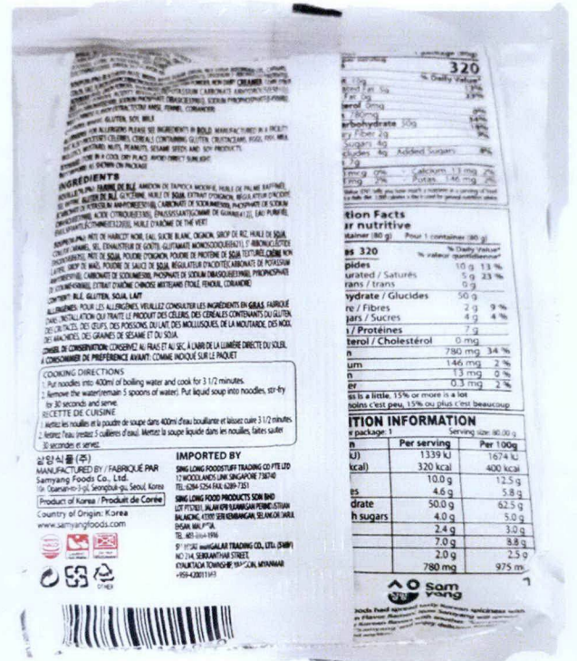
Figure 2. Unregistered Samyang Jjajang Ramen