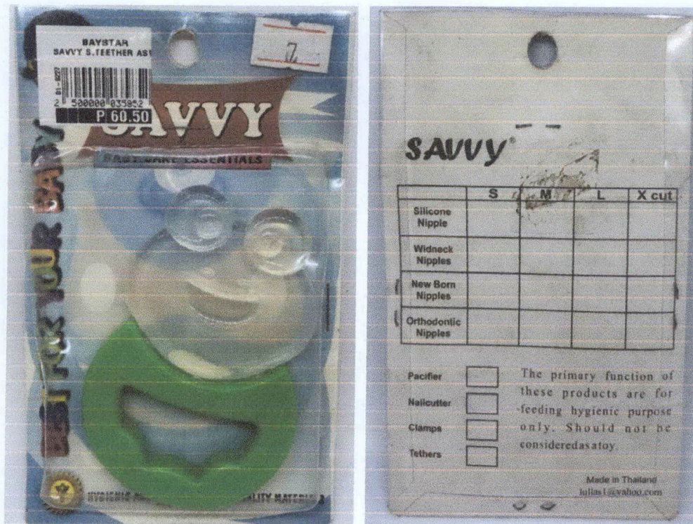
Figure 1. Unnotified Savvy Baby Care Essentials Teether

The Food and Drug Administration (FDA) warns the public from purchasing and using the following Unnotified TCCAs: