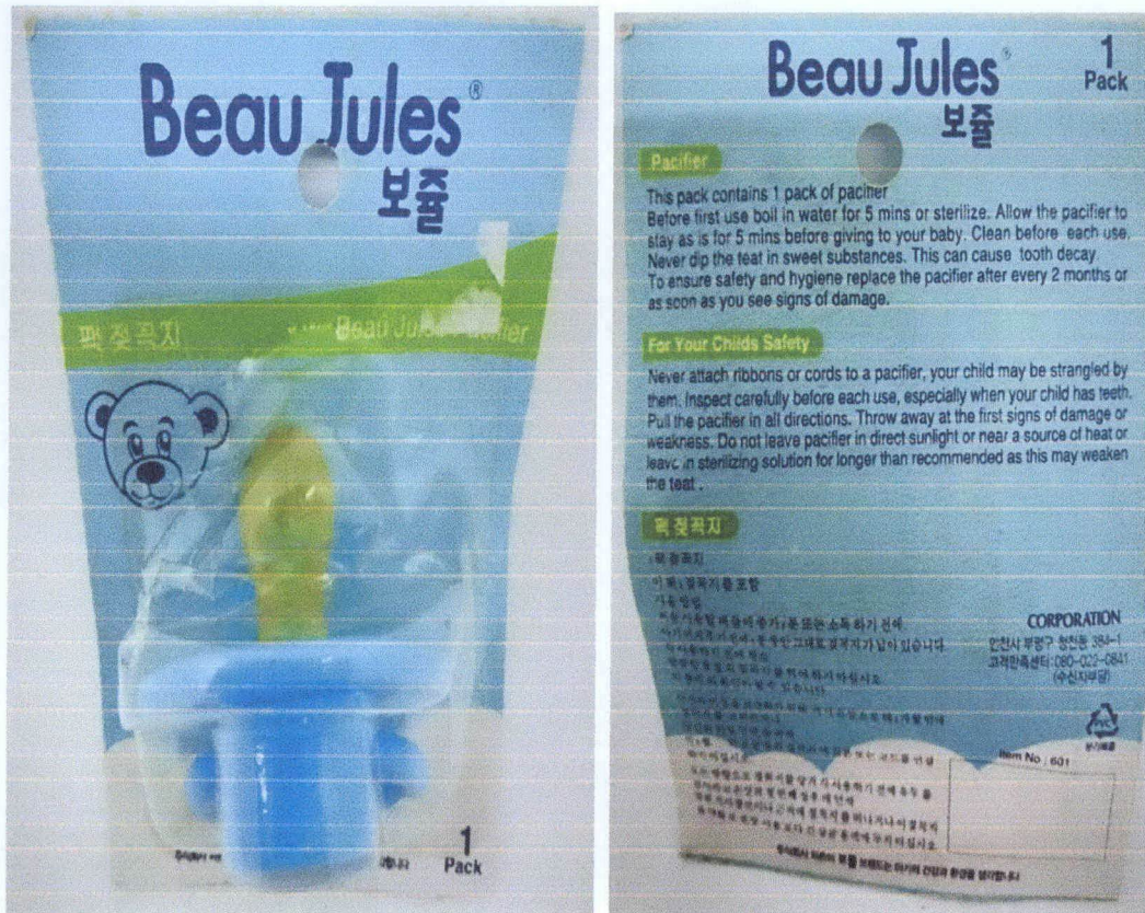
Figure 3. Unnotified Beau Jules Pacifier