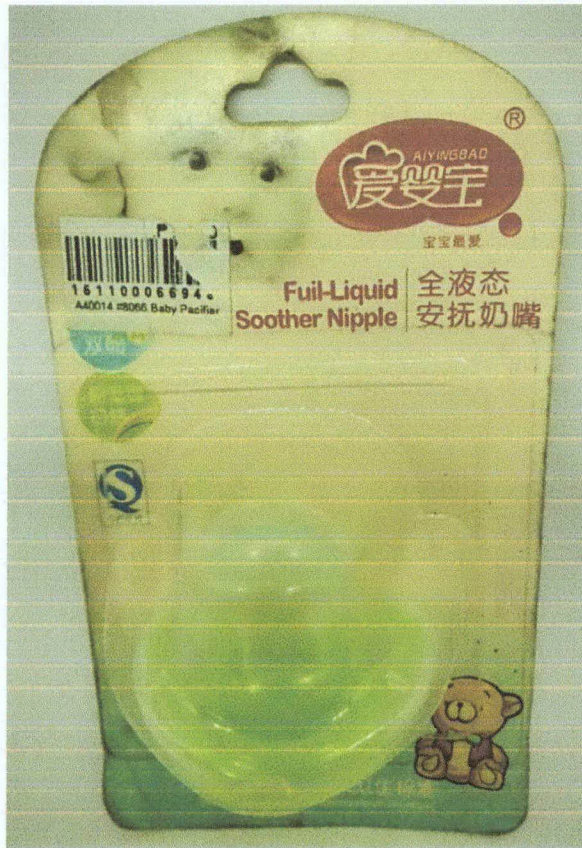
Figure 2. Aiyingbao Full-Liquid Soother Nipple