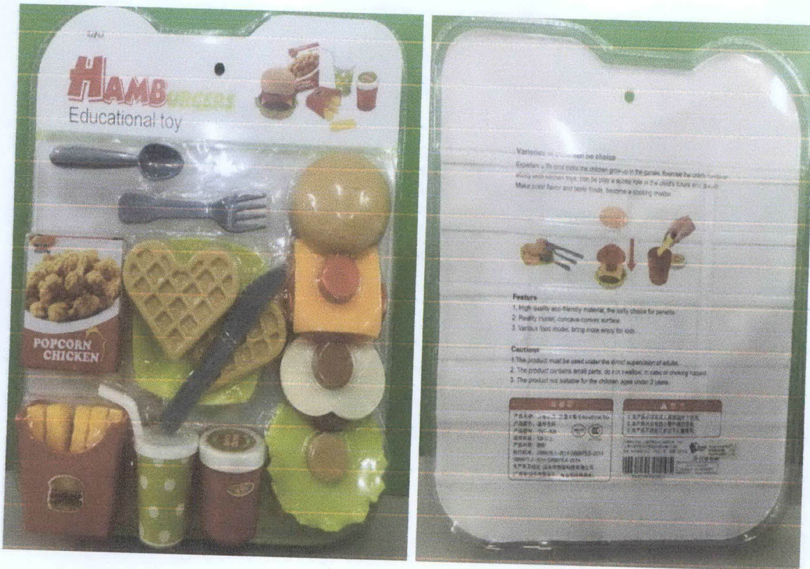
Figure 1. Unnotified Ilahui Hamburger Educational Toys

The Food and Drug Administration (FDA) warns the public from purchasing and using the following Unnotified TCCAs: