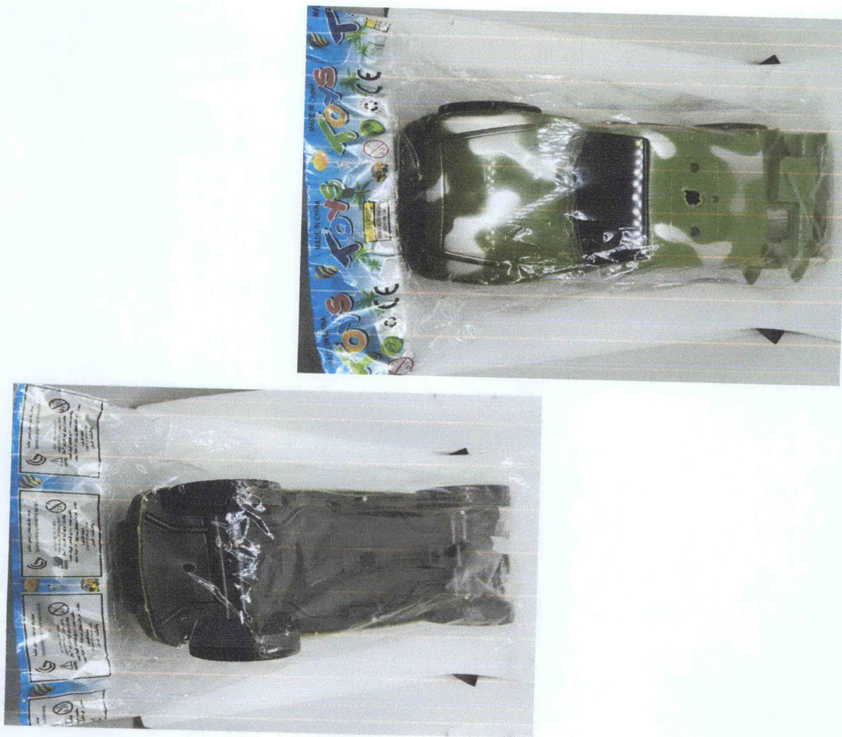
Figure 3. Unnotified Car Toy

The FDA verified through post-marketing surveillance that the abovementioned TCCA products are not authorized and the Certificates of Product Notification (CPN) have not been issued. Pursuant to the Republic Act No. 9711, otherwise known as the “Food and Drug Administration Act of 2009”, the manufacture, importation, exportation, sale, offering for sale, distribution, transfer, non-consumer use, promotion, advertising or sponsorship of health products without the proper authorization is prohibited.