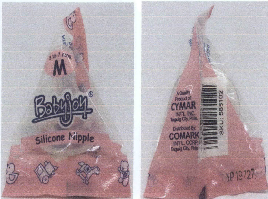
Figure 3. Unnotified Babyjoy Silicone Nipple (M)