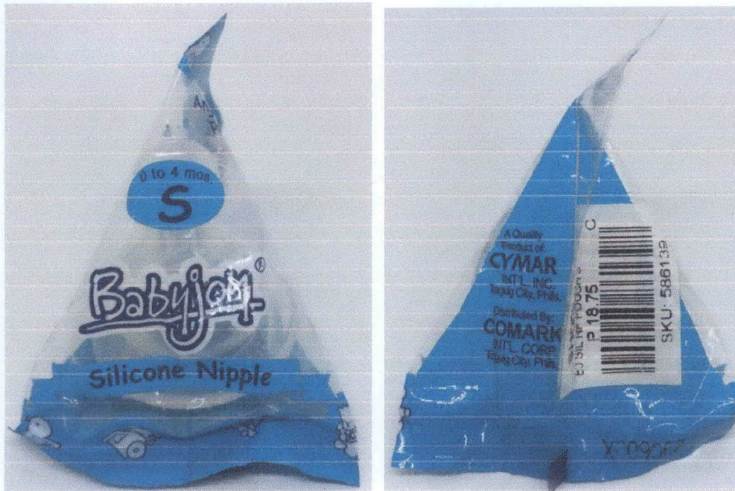
Figure 4. Unnotified Babyjoy Silicone Nipple (S)

The FDA verified through post-marketing surveillance that the abovementioned TCCA products are not authorized and the Certificates of Product Notification (CPN) have not been issued. Pursuant to the Republic Act No. 9711, otherwise known as the “Food and Drug Administration Act of 2009”, the manufacture, importation, exportation, sale, offering for sale, distribution, transfer, non-consumer use, promotion, advertising or sponsorship of health products without the proper authorization is prohibited.