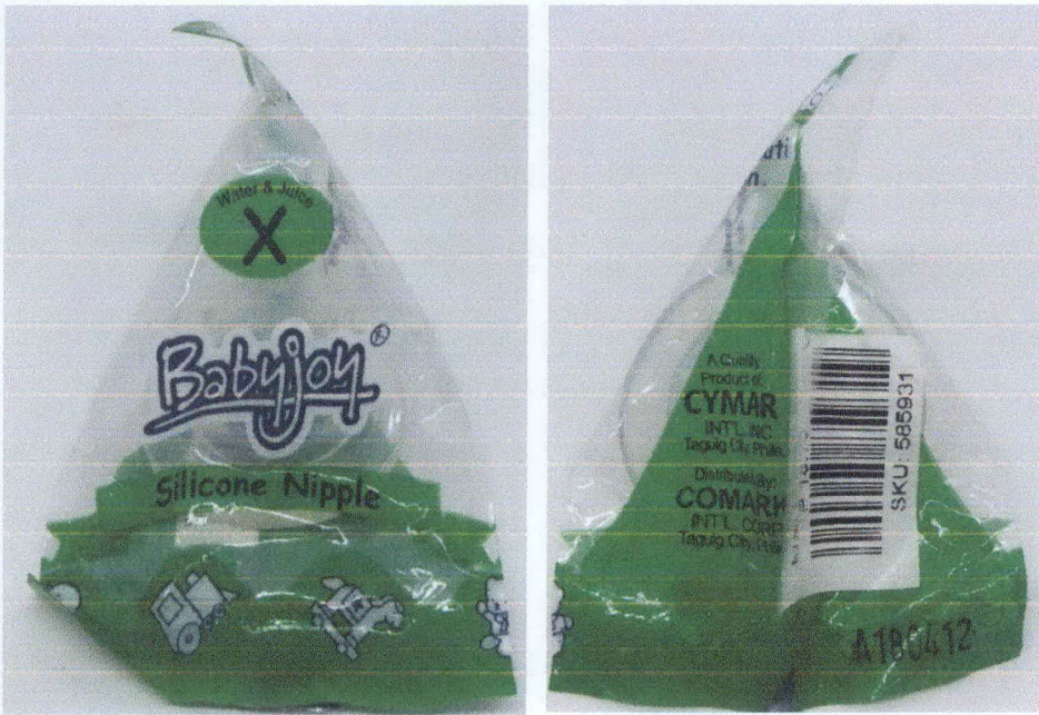
Figure 2. Unnotified Babyjoy Silicone Nipple (X)