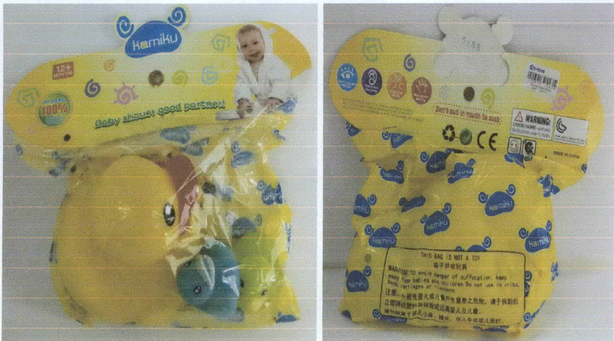
Figure 1. Unnotified Komiku Baby Shower Good Partner

The Food and Drug Administration (FDA) warns the public from purchasing and using the following Unnotified TCCAs: