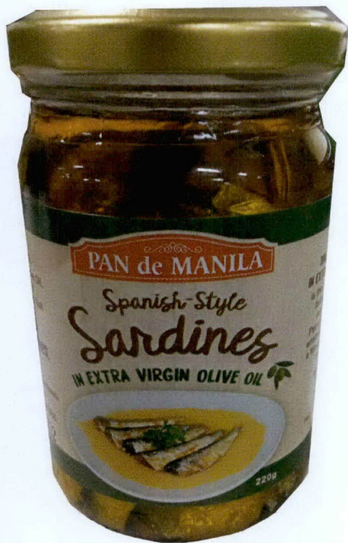
Figure 2. Unregistered PAN DE MANILA Spanish Style Sardines in Extra Virgin Olive Oil