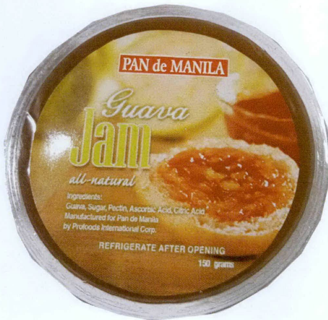
Figure 4. Unregistered PAN DE MANILA Guava Jam, 150g