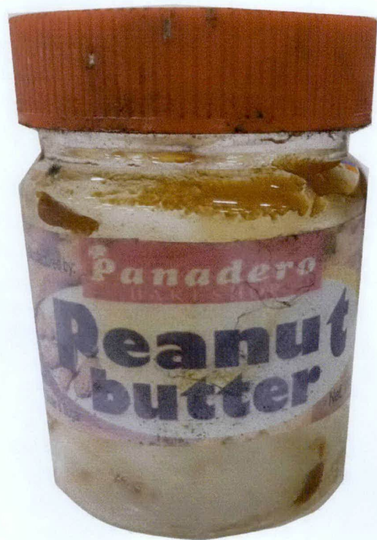
Figure 5. Unregistered PANADERO Peanut Butter