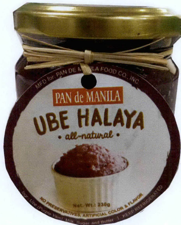
Figure 1. Unregistered PAN DE MANILA Ube Halaya, 230g

The Food and Drug Administration (FDA) warns the public from purchasing and consumption of the following unregistered food products: