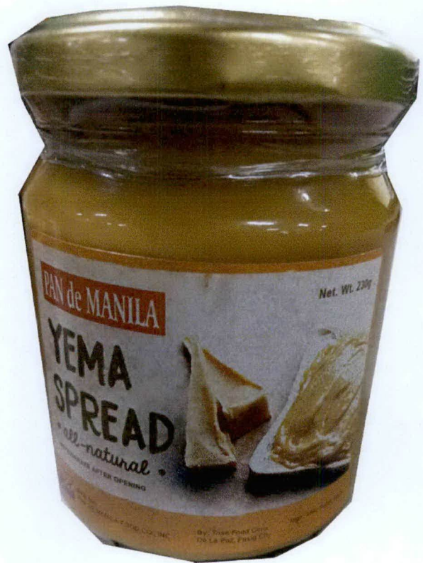
Figure 3. Unregistered PAN DE MANILA Yema Spread