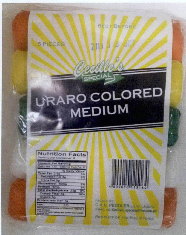
Figure 4. Unregistered CECILLE'S Special Uraro Colored Medium