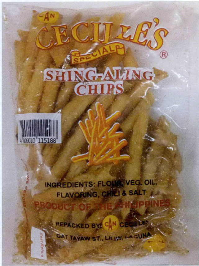
Figure 2. Unregistered CECILLE'S Special Shing-Aling Chips