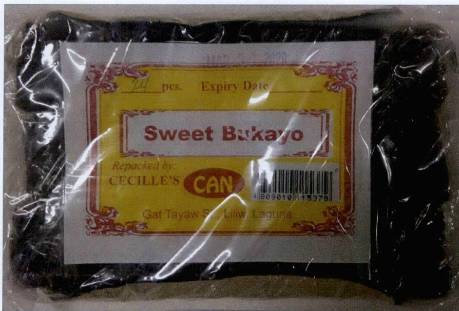
Figure 1. Unregistered CECILLE'S Sweet Bukayo

The Food and Drug Administration (FDA) warns the public from purchasing and consumption of the following unregistered food products: