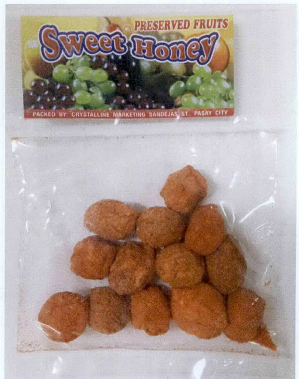
Figure 5. Unregistered SWEET HONEY