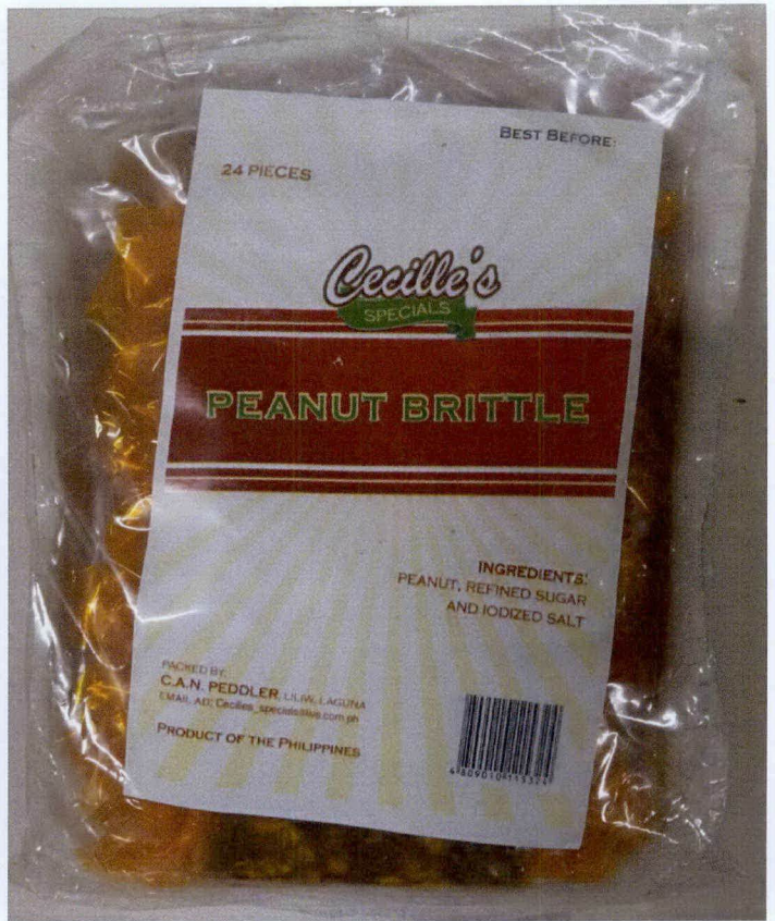
Figure 3. Unregistered CECILLE'S Specials Peanut Brittle