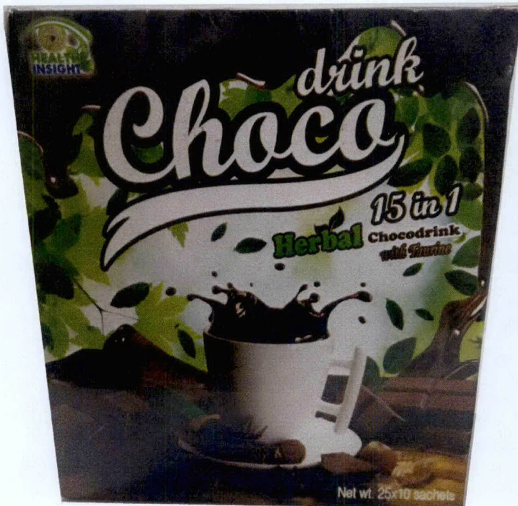
Figure 2. Unregistered HEALTH INSIGHT Choco Drink 15 in1 Herbal Chocodrink with Taurine