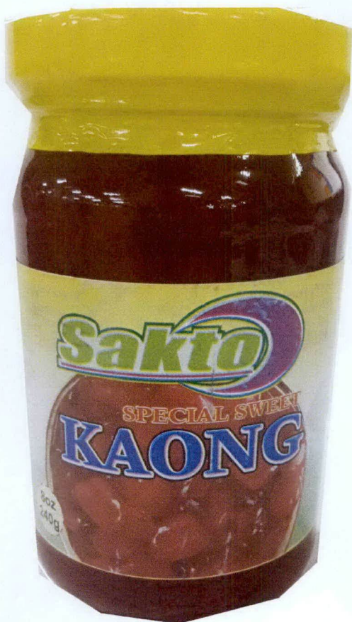
Figure 4. Unregistered SAKTO SPECIAL Sweet Kaong