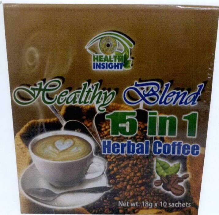
Figure 3. Unregistered HEALTH INSIGHT Healthy Blend 15 in 1 Herbal Coffee