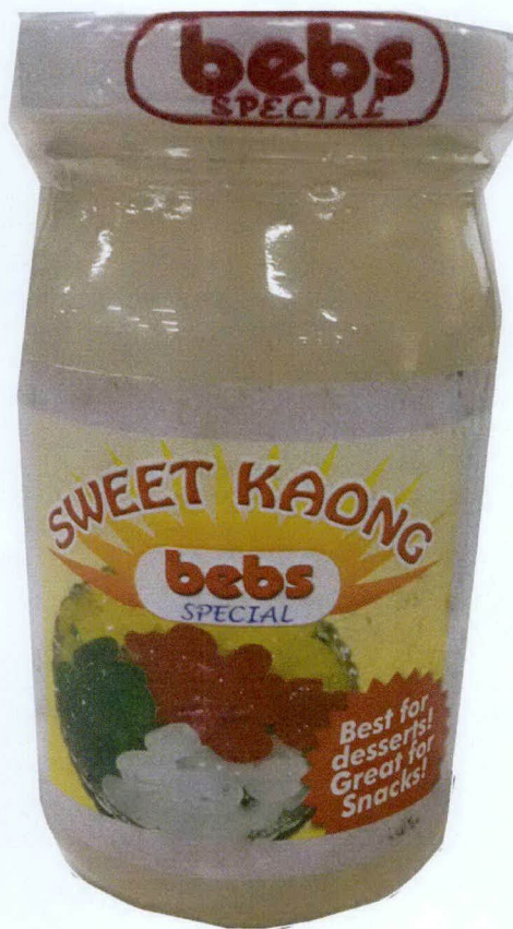
Figure 5. Unregistered BEBS SPECIAL Sweet Kaong