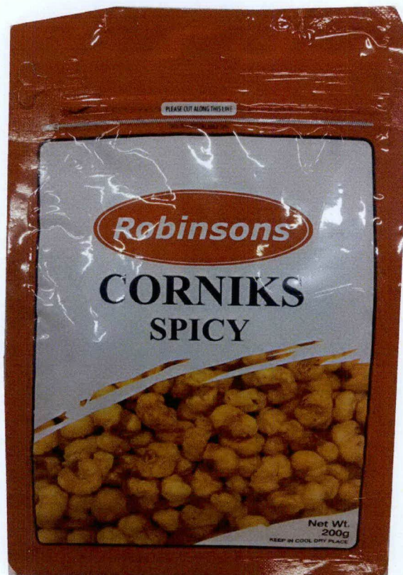
Figure 1. Unregistered ROBINSONS Corniks Spicy

The Food and Drug Administration (FDA) warns the public from purchasing and consumption of the following unregistered food products: