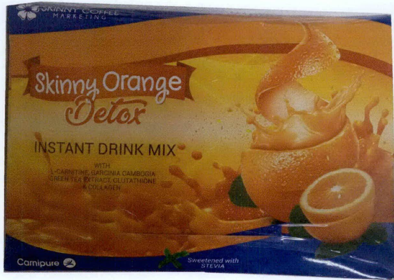
Figure 2. Unregistered SKINNY ORANGE Detox Instant Drink Mix with L-Carnitine, Garcinia Cambogia, Green Tea Extract, Glutathione & Collagen