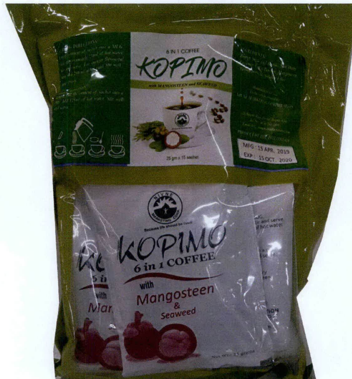
Figure 1. Unregistered KOPIMO 6 in 1 Coffee with Mangosteen & Seaweed

The Food and Drug Administration (FDA) warns the public from purchasing and consumption of the following unregistered food products: