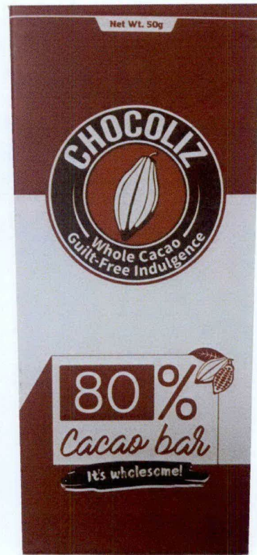
Figure 3. Unregistered CHOCOLIZ 80% Cacao Bar