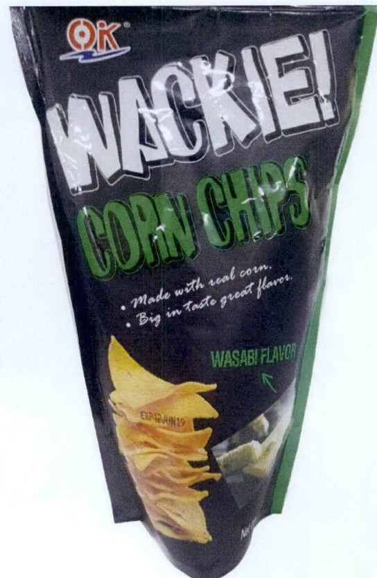
Figure 5. Unregistered OK WACKIE! Corn Chips, Wasabi Flavor