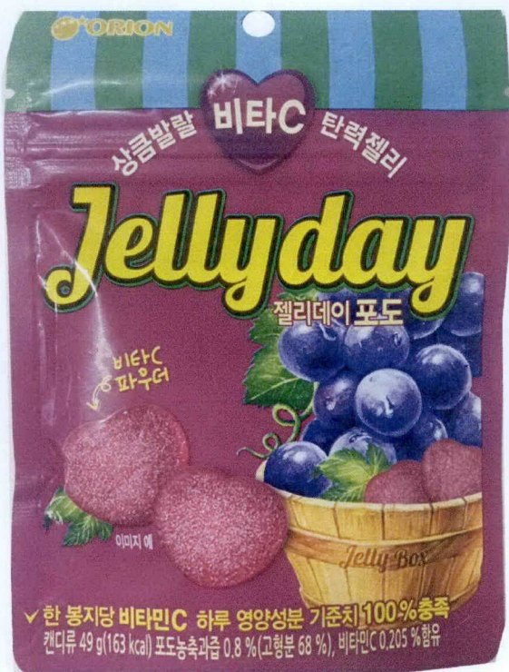
Figure 4. Unregistered ORION Jellyday