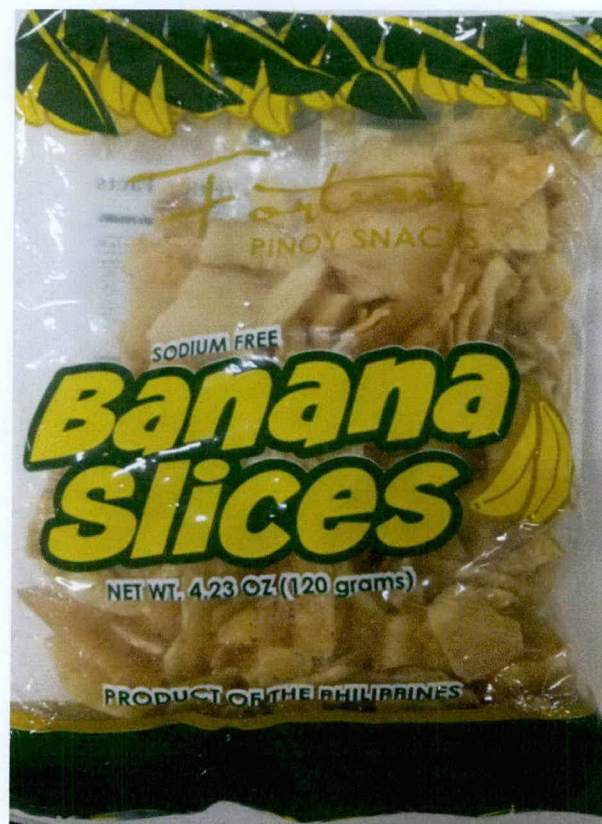
Figure 1. Unregistered FORTUNE PINOY SNACKS Banana Slices, 120g

The Food and Drug Administration (FDA) warns the public from purchasing and consumption of the following unregistered food products: