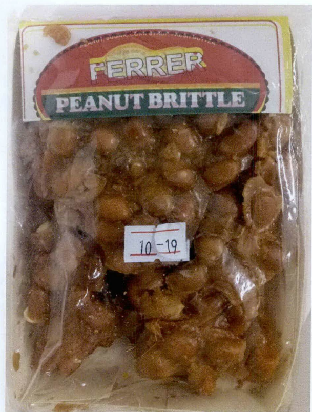
Figure 5. Unregistered FERRER Peanut Brittle