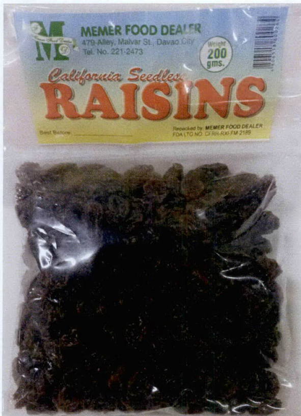
Figure 2. Unregistered CALIFORNIA SEEDLES Raisins