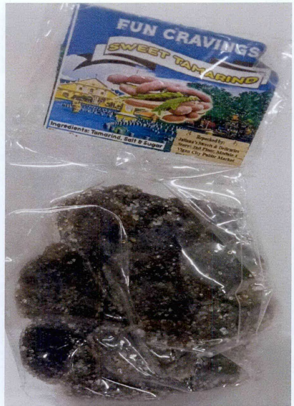
Figure 3. Unregistered FUN CRAVINGS Sweet Tamarind