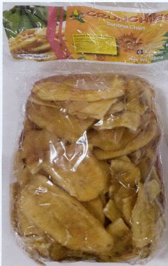
Figure 4. Unregistered CRUNCHIES Banana Chips