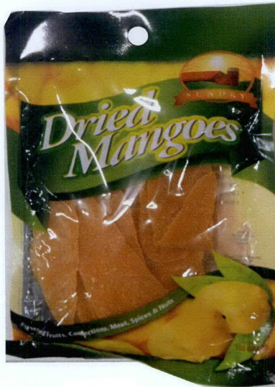
Figure 1. Unregistered SUNDRY Dried Mangoes

The Food and Drug Administration (FDA) warns the public from purchasing and consumption of the following unregistered food products: