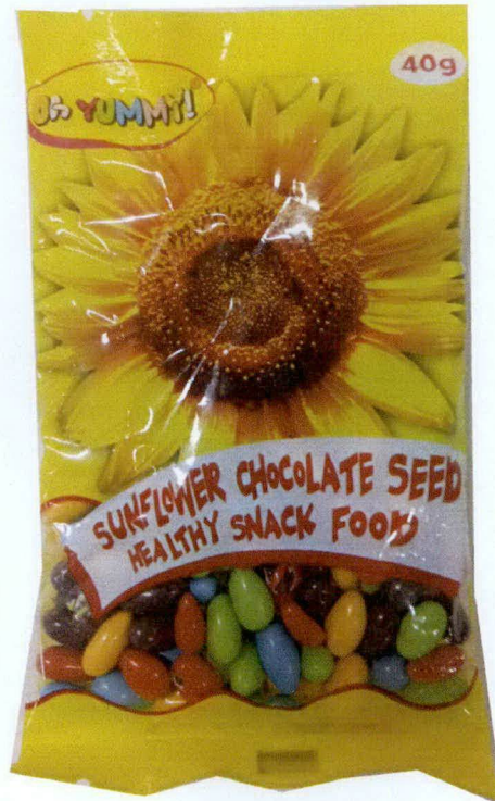
Figure 4. Unregistered OH YUMMY Sunflower Chocolate Seed, 40g