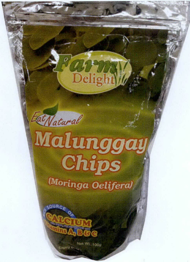
Figure 2. Unregistered FARM DELIGHT Malunggay Chips (Moringa Oelifera)