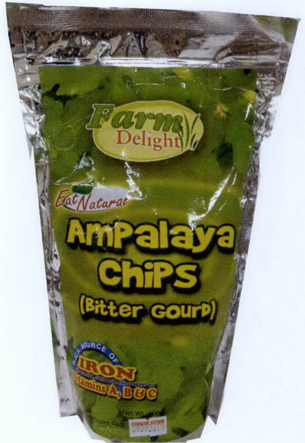
Figure 3. Unregistered FARM DELIGHT Ampalaya Chips (Bitter Gourd)