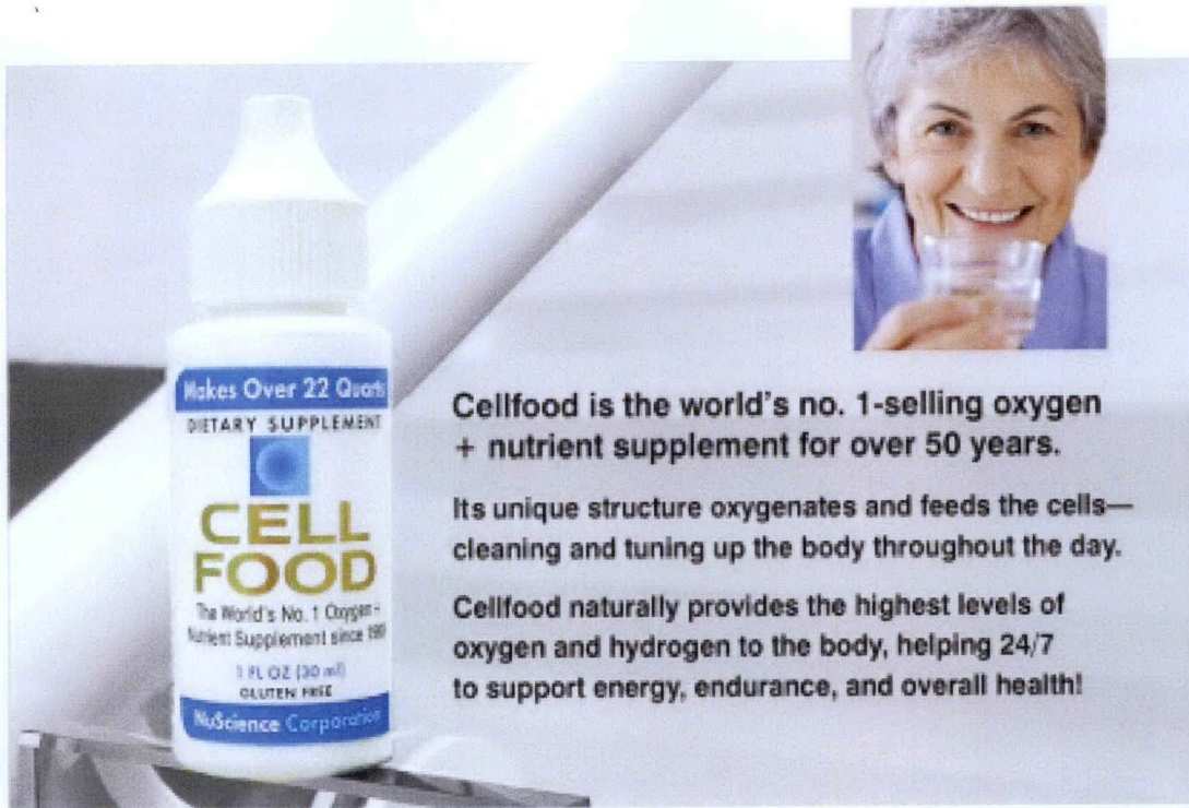
Figure 2. Unregistered CELLFOOD Oxygen + Nutrient Dietary Supplement