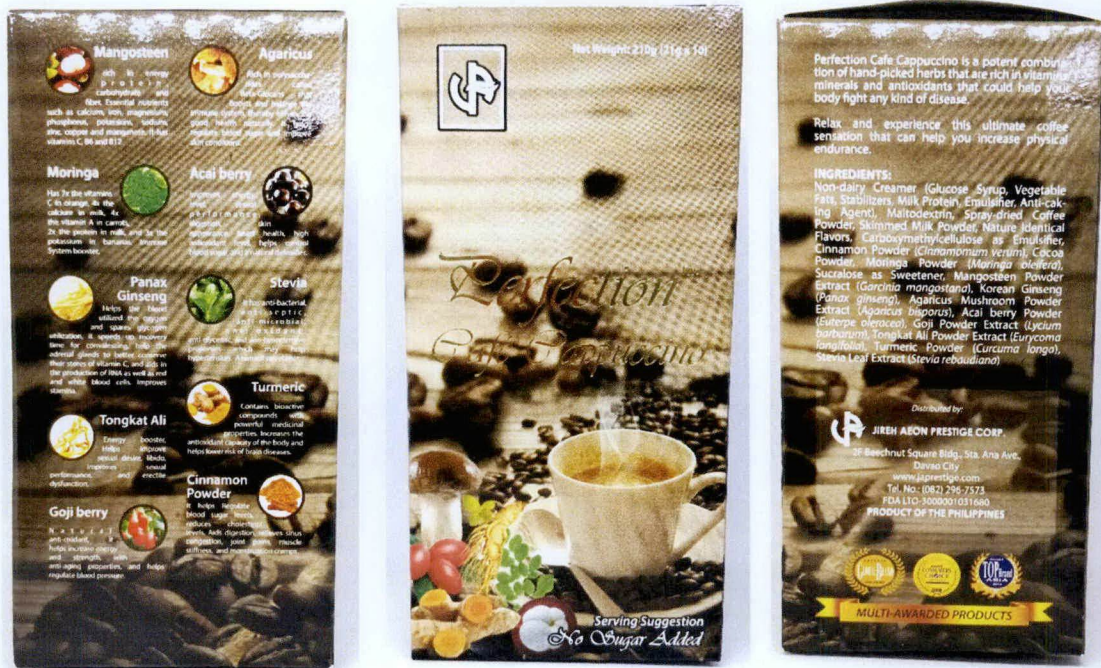
Figure 1. Unregistered PERFECTION Café Cappuccino Coffee Mix

The Food and Drug Administration (FDA) advises the public from purchasing and consumption of the following unregistered food product and Food Supplements: