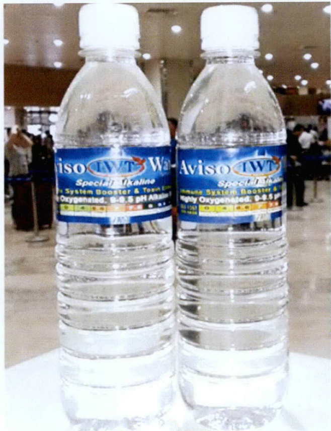
Figure 4. Unregistered Aviso Water