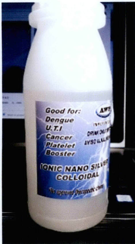
Figure 3. Unregistered Ionic Nano Silver Colloidal