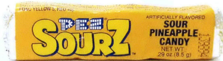
Figure 4. Unregistered PEZ SOURZ Sour Green Pineapple Candy