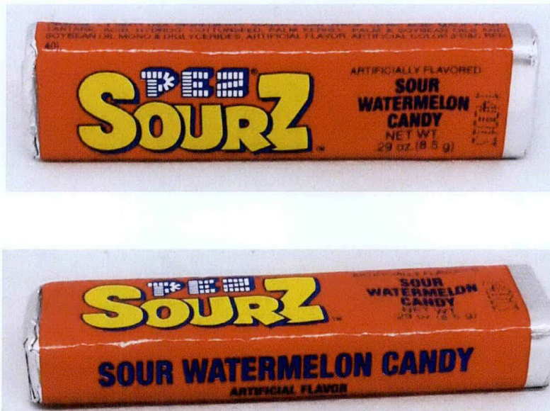
Figure 1. Unregistered PEZ SOURZ Sour Watermelon Candy

The Food and Drug Administration (FDA) warns the public from purchasing and consumption of the following unregistered food products: