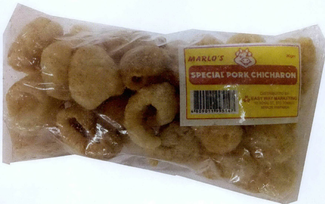
Figure 1. Unregistered MARLO'S Special Pork Chicharon

The Food and Drug Administration (FDA) warns the public from purchasing and consumption of the following unregistered food products: