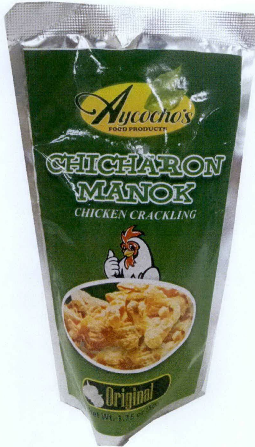
Figure 2. Unregistered AYCOCHO'S FOOD PRODUCT Chicharon Manok Chicken Crackling