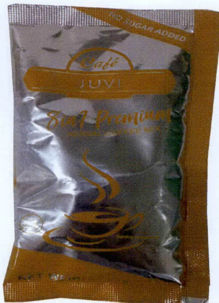
Figure 4. Unregistered CAFÉ JUVI 8 in 1 Premium Herbal Coffee Mix