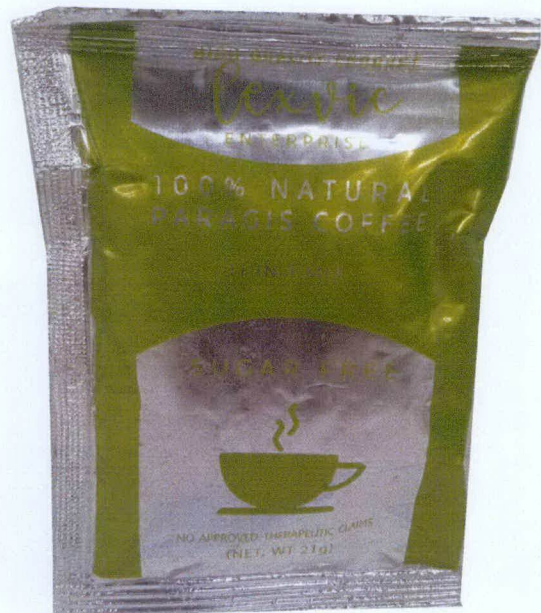
Figure 5. Unregistered LEXVIC ENTERPRISE 100% Natural Paragis Coffee, Sugar Free