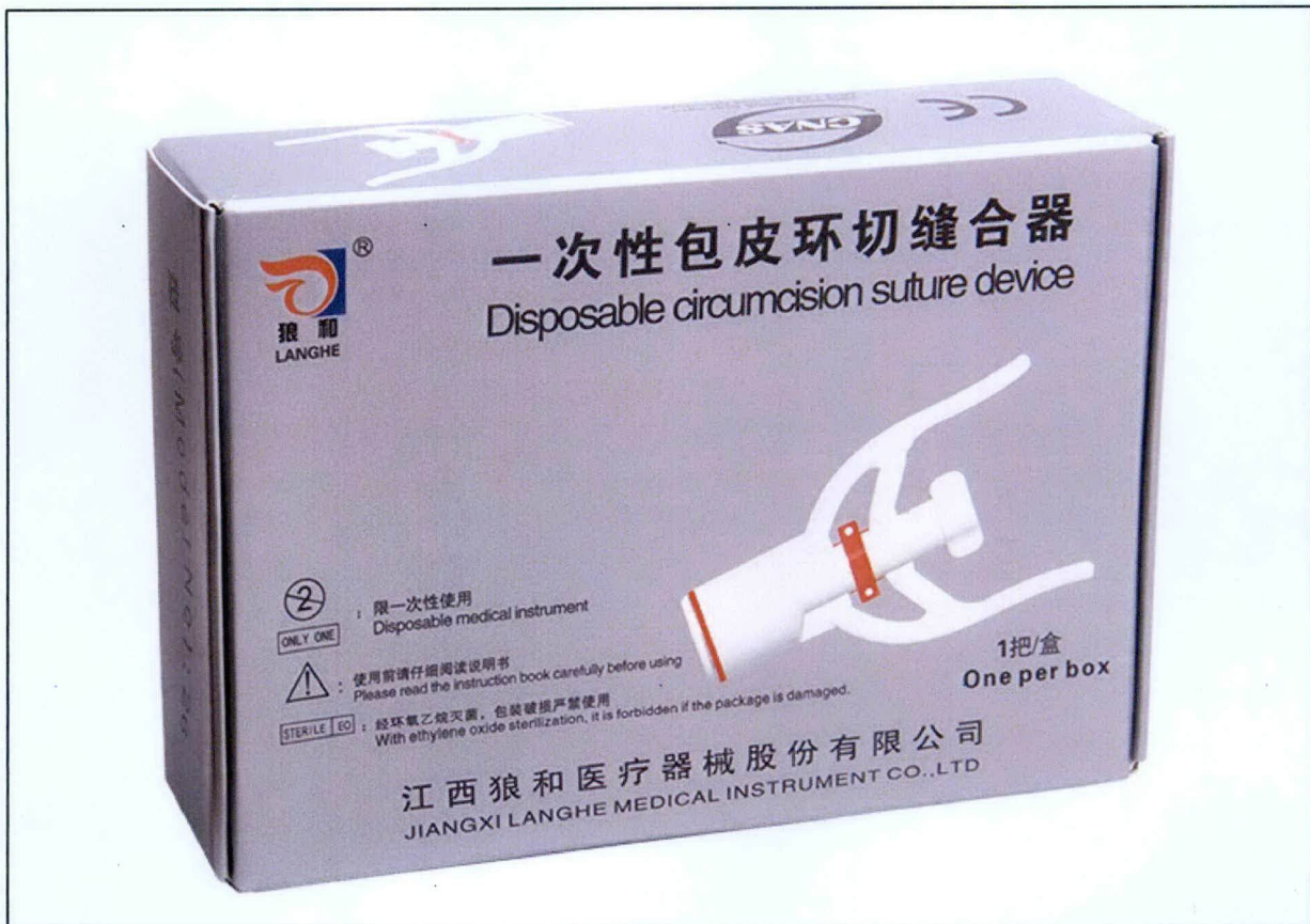
Figure 1. Unregistered Langhe® Disposable Circumcision Suture Device

The Food and Drug Administration (FDA) warns all healthcare professionals and the general public against the purchase and use of the unregistered medical device: