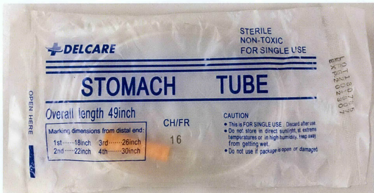
Figure 1. Unregistered Delcare – Stomach Tube

The Food and Drug Administration (FDA) warns all healthcare professionals and the general public against the purchase and use of the unregistered medical device: