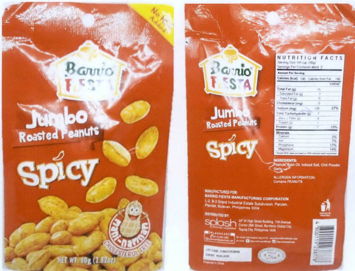
Figure 1. Principal Display Panel and Information Display Panel of the approved label of BARRIO FIESTA JUMBO ROASTED PEANUTS (SPICY) Food Product with registration number FR-4000004278106 valid until 13 September 2021

The Food and Drug Administration (FDA) informs the public that the food product BARRIO FIESTA JUMBO ROASTED PEANUTS (SPICY) has been registered by the Market Authorization Holder, BARRIO FIESTA MANUFACTURING CORPORATION in accordance to existing FDA rules and regulations.