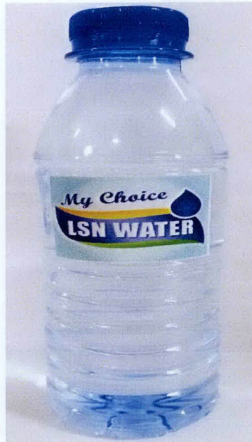
Figure 2. Unregistered MY CHOICE LSN Water