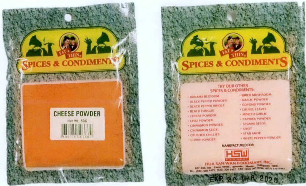
Figure 4. Unregistered FAT & THIN Spices & Condiments Cheese Powder