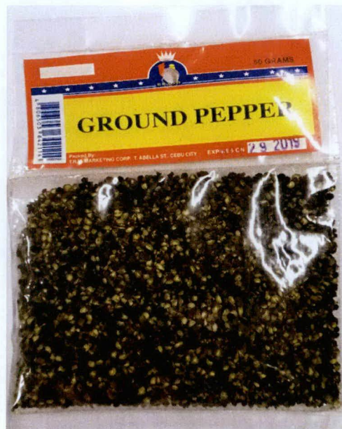
Figure 3. Unregistered T.R.H Ground Pepper