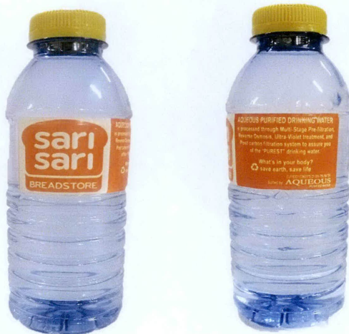
Figure 1. Unregistered SARI SARI BREADSTORE Aqueous Purified Drinking Water

The Food and Drug Administration (FDA) advises the public from purchasing and consumption of the following unregistered food products: