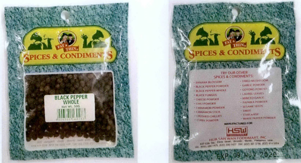
Figure 5. Unregistered FAT & THIN Spices & Condiments Whole Black Pepper

The FDA verified through post-marketing surveillance that the abovementioned food products are not authorized and the Certificates of Product Registration (CPR) have not been issued. Pursuant to the Republic Act No. 9711, otherwise known as the “Food and Drug Administration Act of 2009”, the manufacture, importation, exportation, sale, offering for sale, distribution, transfer, non-consumer use, promotion, advertising or sponsorship of health products without the proper authorization is prohibited.