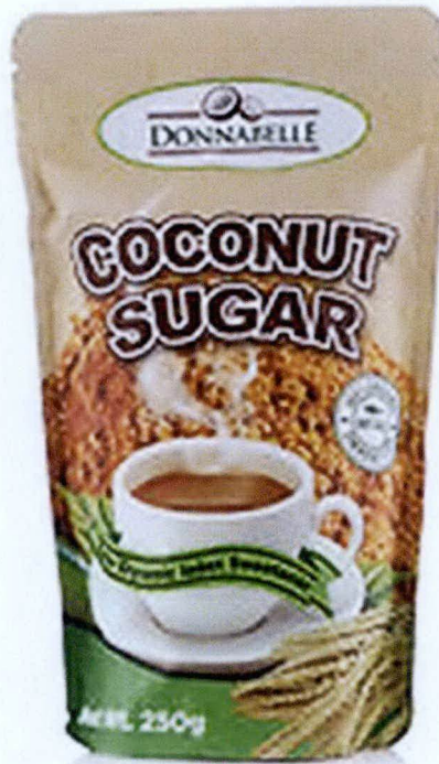
Figure 4. Unregistered DONNABELLE Coconut Sugar