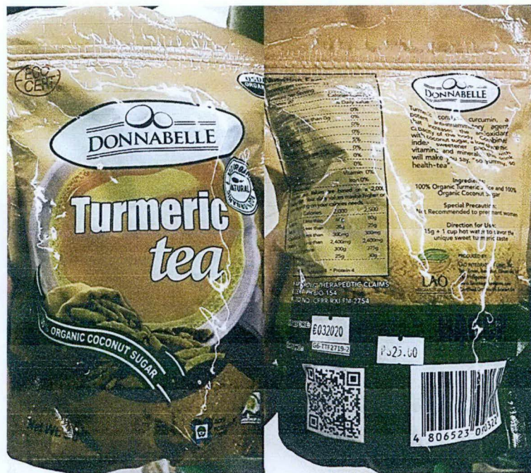
Figure 2. Unregistered DONNABELLE Turmeric Tea with 100% Coconut Sugar