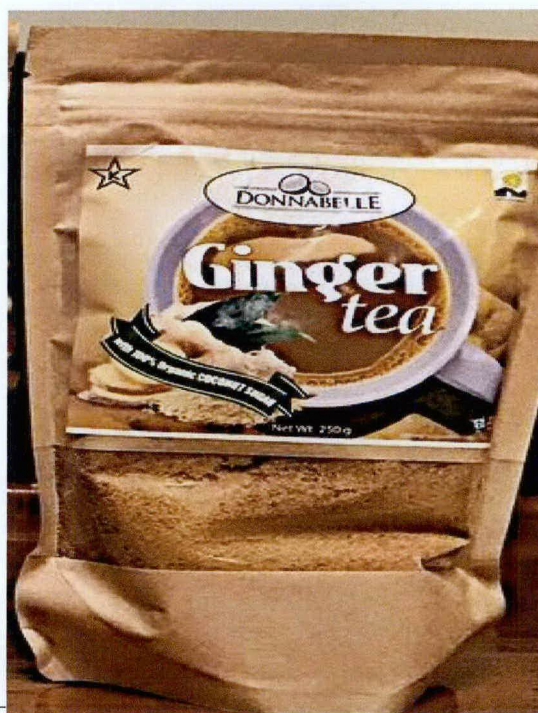
Figure 3. Unregistered DONNABELLE Ginger Tea with 100% Coconut Sugar