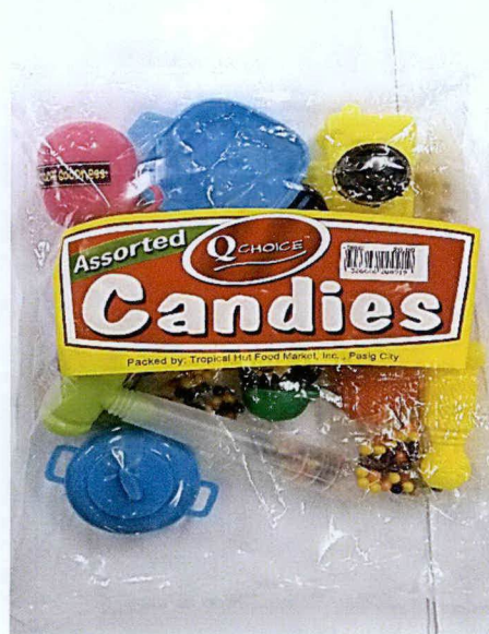
Figure 5. Unregistered QCHOICE™ Assorted Candies

The FDA verified through post-marketing surveillance that the abovementioned food products are not authorized and the Certificates of Product Registration (CPR) have not been issued. Pursuant to the Republic Act No. 9711, otherwise known as the “Food and Drug Administration Act of 2009”, the manufacture, importation, exportation, sale, offering for sale, distribution,