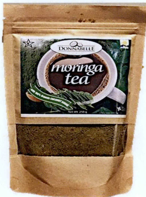
Figure 1. Unregistered DONNABELLE Moringa Tea with 100% Coconut Sugar

The Food and Drug Administration (FDA) advises the public from purchasing and consumption of the following unregistered food products: