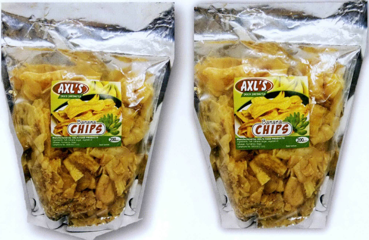
Figure 5. AXL'S Banana Chips (200 grams)