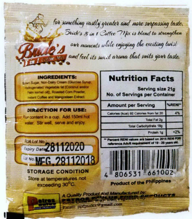
Figure 3. Unregistered BRIDE'S 5-in-1 Coffee Mix with Roasted Corn Powder Mangosteen Extract (21grams)