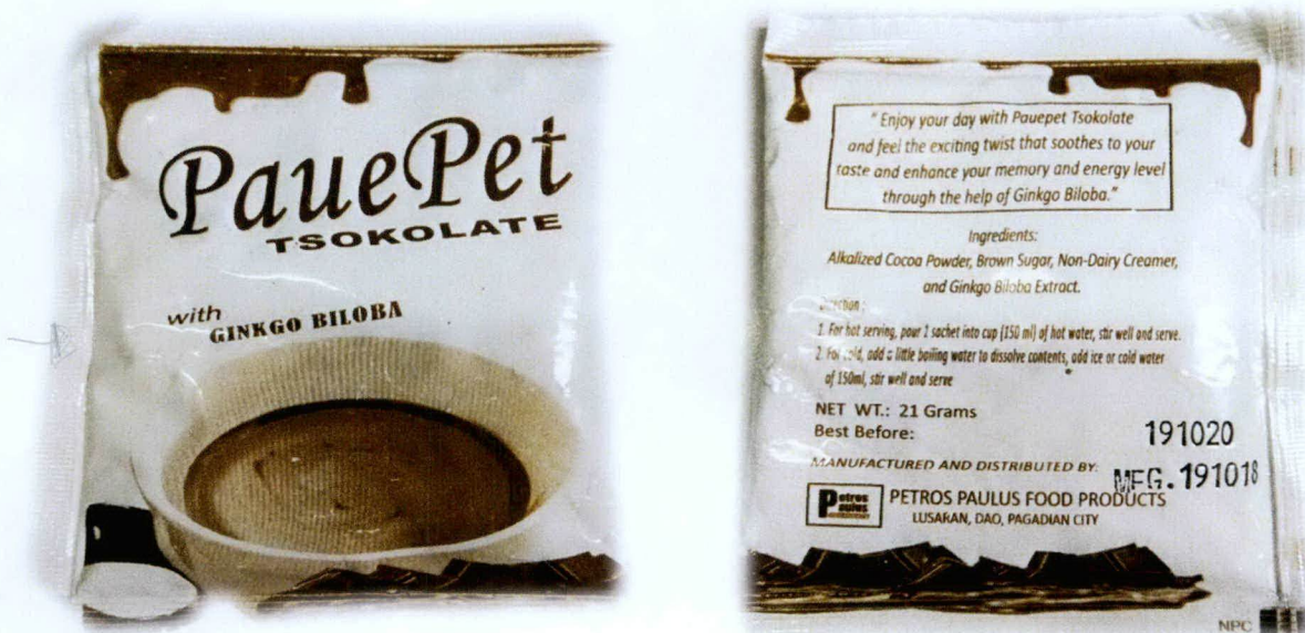
Figure 1. Unregistered PAUEPET Tsokolate with Gingko Biloba (21 grams)

The Food and Drug Administration (FDA) advises the public from purchasing and consumption of the following unregistered food products: