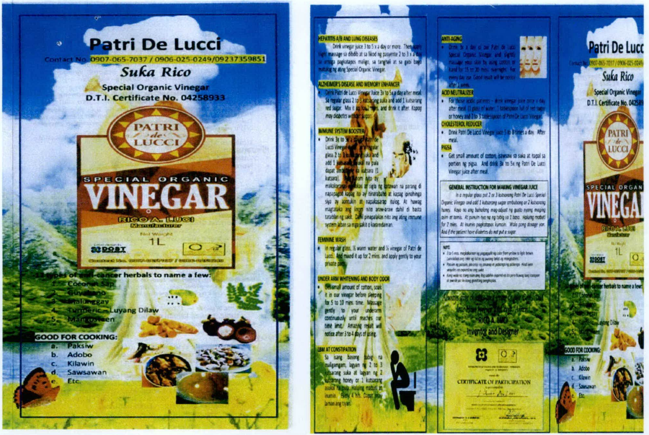
Figure 4. PATRI DE LUCCI Special Organic Vinegar (1 Liter)