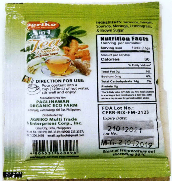
Figure 2. Unregistered AGRIKO Turmeric Tea Powder with Brown Sugar 5-in-1 Turmeric (20grams)