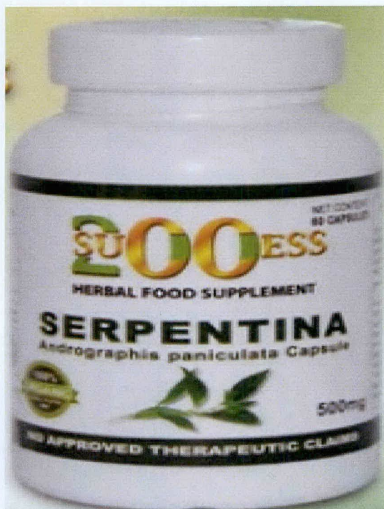
Figure 3. Unregistered SUCCESS 200 Herbal Food Supplement Serpentina Andrographis Paniculata Capsules