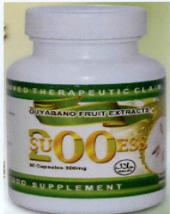
Figure 4. Unregistered SUCCESS 200 Guyabano Fruit Extracts