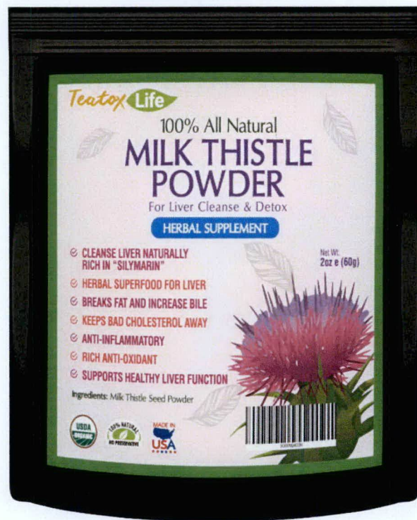
Figure 2. Unregistered TEATOX LIFE 100% All Natural Milk Thistle Powder for Liver Cleanse and Detox Herbal Supplement