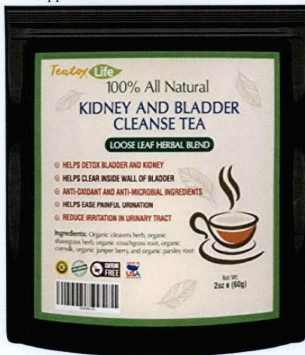
Figure 1. Unregistered TEATOX LIFE 100% All Natural Kidney and Bladder Cleanse Tea Loose leaf Herbal Blend

The Food and Drug Administration (FDA) warns the public from purchasing and consuming the following unregistered food supplements: