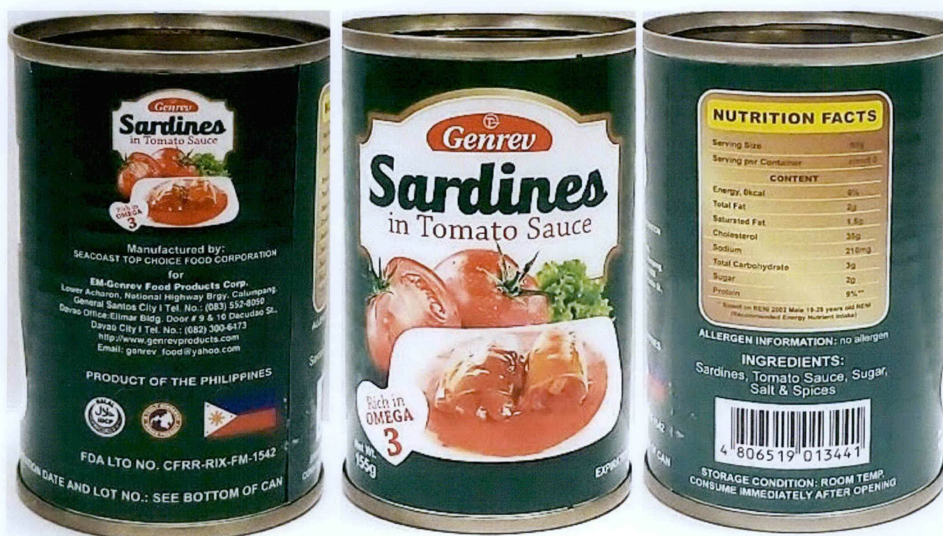
Figure 4. Unregistered GENREV Sardines in Tomato Sauce