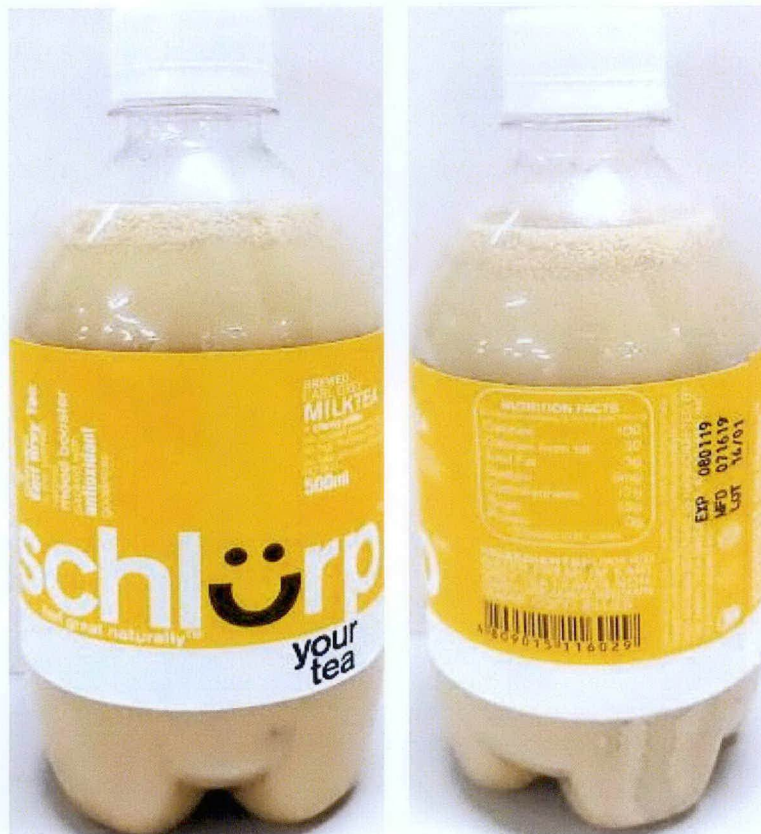
Figure 1. Unregistered SCHLURP™ Your Tea Brewed Earl Grey Milktea+ Chewy Jellies

The Food and Drug Administration (FDA) warns the public from purchasing and consumption of the following unregistered food products: