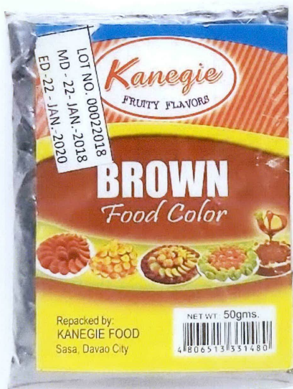
Figure 3. Unregistered KANEGIE Fruity Flavors Brown Food Color