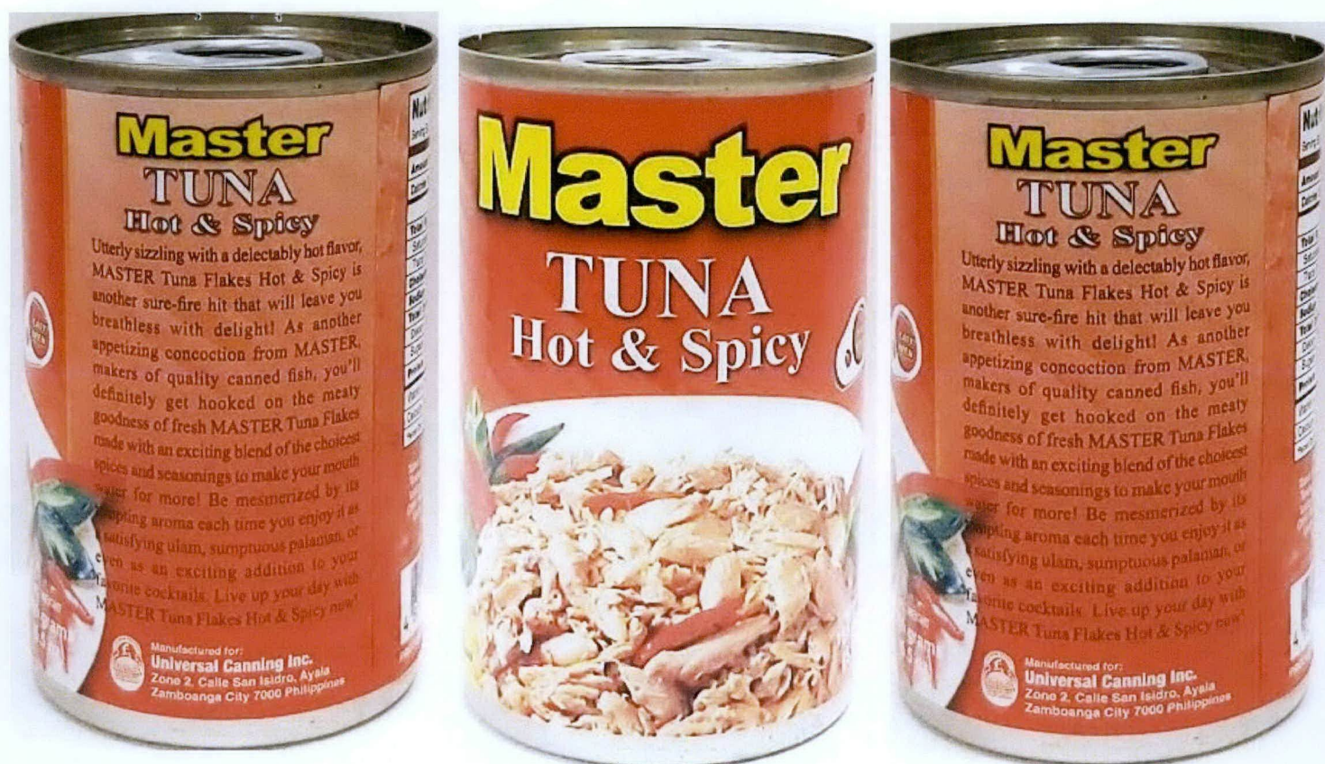
Figure 5. Unregistered MASTER Tuna Hot and Spicy

The FDA verified through post-marketing surveillance that the above mentioned food products are not registered and the Certificate of Product Registration (CPR) have not yet been issued. Pursuant to the Republic Act No. 9711, otherwise known as the “Food and Drug Administration Act of 2009”, the manufacture, importation, exportation, sale, offering for sale, distribution, transfer, non-consumer use, promotion, advertising or sponsorship of health products without the proper authorization is prohibited.