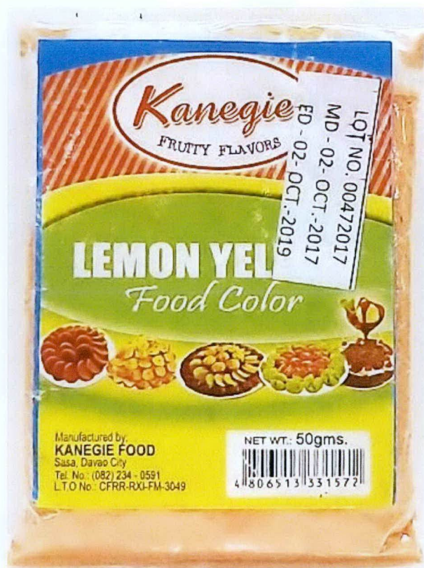
Figure 2. Unregistered KANEGIE Fruity Flavors Lemon Yellow Food Color