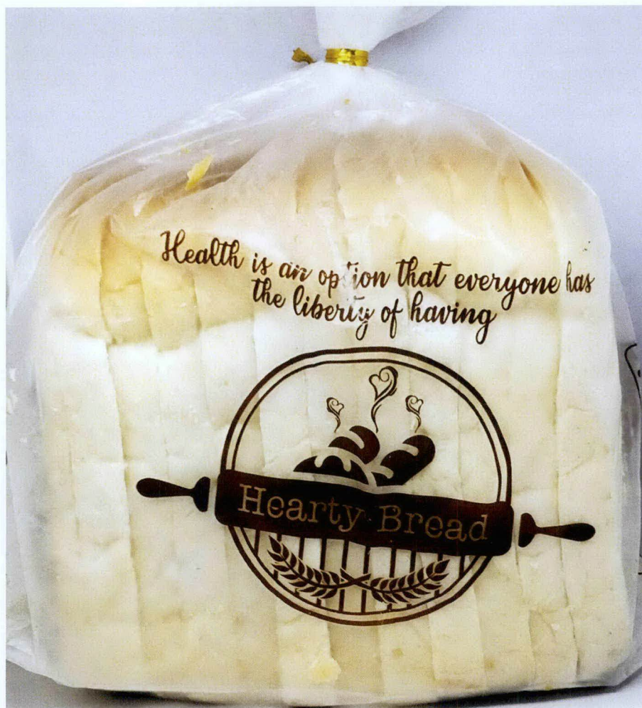
Figure 1. Principal Display Panel of the Unregistered HEARTY BREAD'S EZEKIEL Bread Loaf

The Food and Drug Administration (FDA) advises the public from purchasing and consumption of the unregistered food product HEARTY BREAD'S EZEKIEL Bread Loaf.