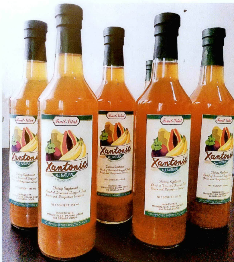
Figure 1. Unregistered FRUIT VITAL Xantonic All Natural Dietary Supplement

The Food and Drug Administration (FDA) advises the public from purchasing and consumption of the following unregistered food supplements and food products: