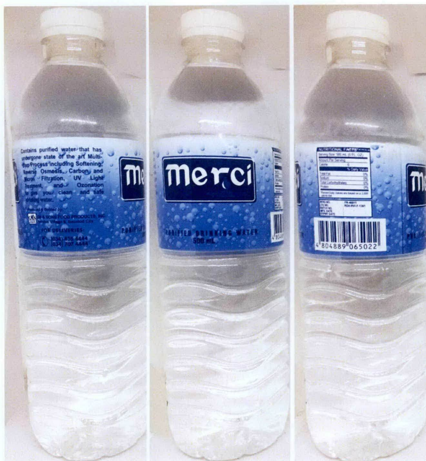
Figure 4. Unregistered MERCI Purified Drinking Water

The FDA verified through post-marketing surveillance that the abovementioned food supplements and food products are not authorized and the Certificates of Product Registration (CPR) have not been issued. Pursuant to the Republic Act No. 9711, otherwise known as the “Food and Drug Administration Act of 2009”, the manufacture, importation, exportation, sale, offering for sale, distribution, transfer, non-consumer use, promotion, advertising or sponsorship of health products without the proper authorization is prohibited.