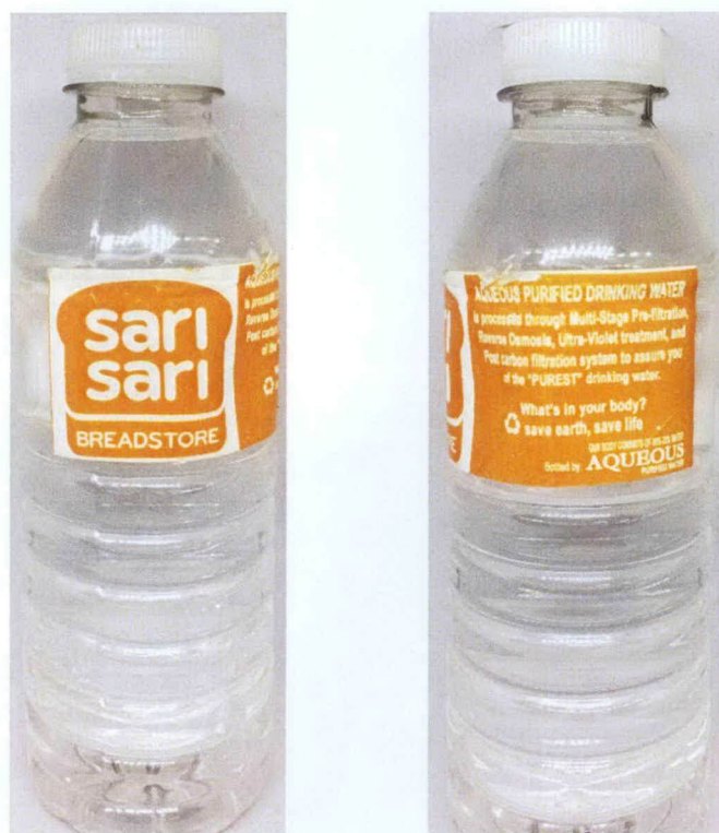
Figure 3. Unregistered SARI SARI BREADSTORE Bottled Water