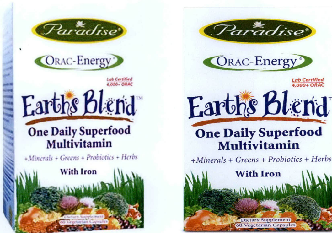
Figure 4. Unregistered PARADISE ORAC-ENERGY EARTH'S BLEND One Daily Superfood Multivitamin with Iron Dietary Supplement (60 vegetarian capsules x bottle x box)