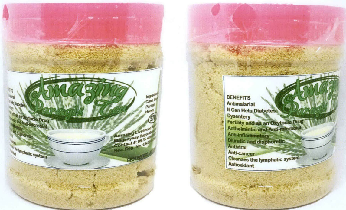
Figure 1. Unregistered AMAZING Paragis Tea

The Food and Drug Administration (FDA) warns the public from purchasing and consuming the following unregistered food supplements: