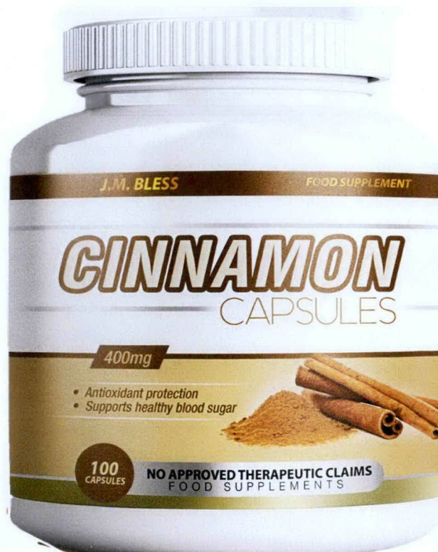
Figure 3. Unregistered J.M BLESS Cinnamon Capsules 400mg Food Supplement (100 capsules x bottle)