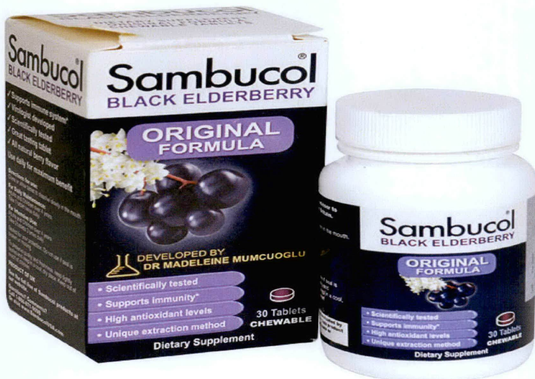
Figure 5. Unregistered SAMBUCOL Black Elderberry Original Formula Dietary Supplement Chewable Tablet (30 chewable tablet x bottle x box)