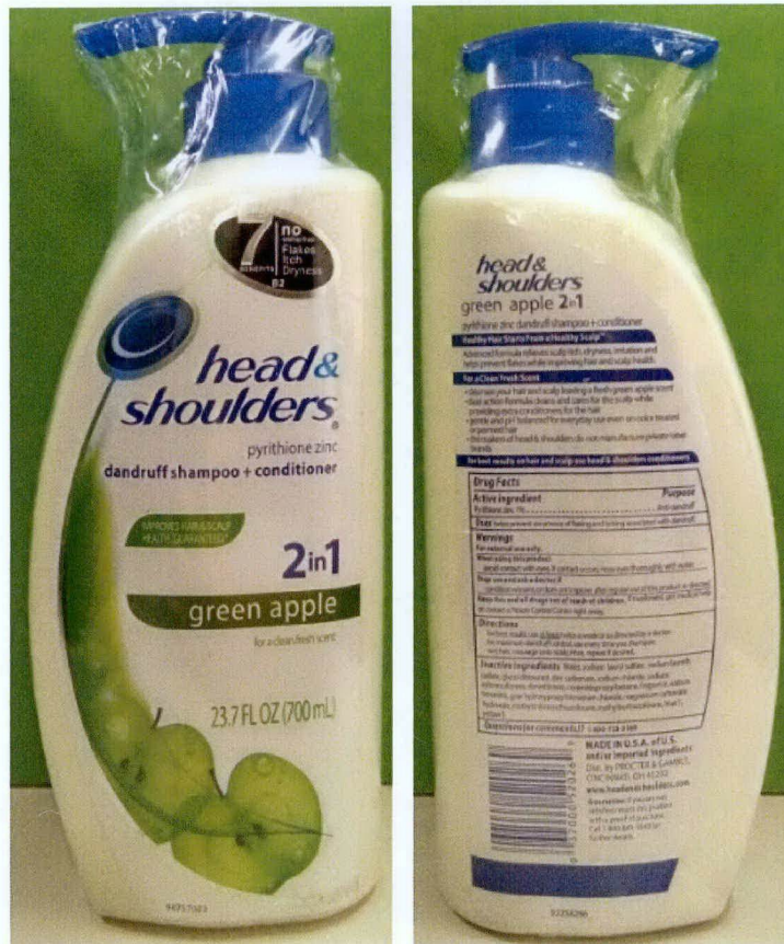
Figure 1. Counterfeit Head & Shoulders® Green Apple 2in1 Dandruff Shampoo + Conditioner

The Food and Drug Administration (FDA) warns the public from purchasing and using the below counterfeit cosmetic product: